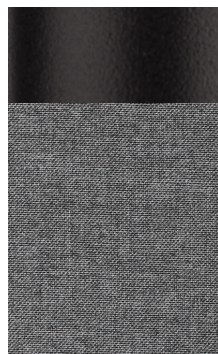
BLACK FRAME CAST SLATE