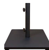
ROLLING STEEL 120 LB