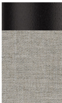
BLACK FRAME CAST SILVER

POLYESTER FABRICS MANUFACTURED BY O'BRAVIA WITH A 4 YEAR WARRANTY AGAINST FADING.