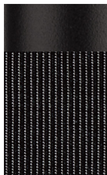
BLACK FRAME CANVAS COAL