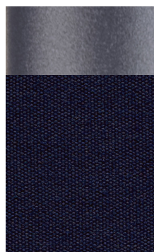
ANTHRACITE FRAME NAVY

Helping you create the perfect outdoor oasis is our number one priority. Transform your space today!