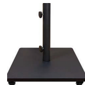
ROLLING STEEL 120 LB