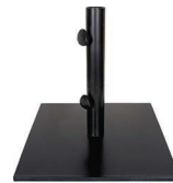
FLAT STEEL 35 LB / 70 LB