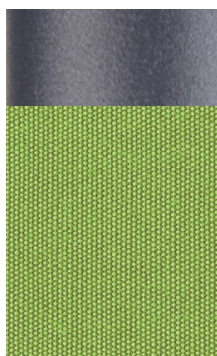
ANTHRACITE FRAME KIWI