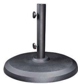
GARDEN 50 LB