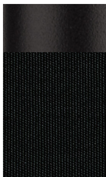
BLACK FRAME BLACK