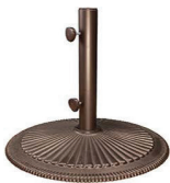
CLASSIC 50 LB