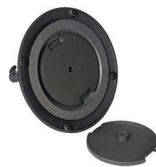
ADD ON WEIGHT 30 LB