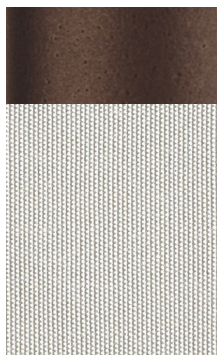
BRONZE FRAME CANVAS