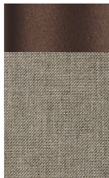
BRONZE FRAME CAST ASH

ACRYLIC FABRICS MANUFACTURED BY SUNBRELLA & OTHERS WITH A 5 YEAR WARRANTY AGAINST FADING.