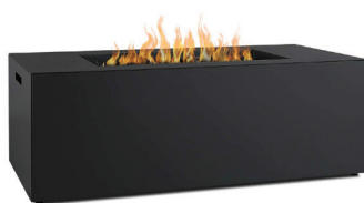
PORTER RECTANGLE FIRE TABLE W 58" / D 28" / H 20" / 28" LINEAR BURNER LP 65,000 BTU 100 LBS / CHARCOAL FINISH