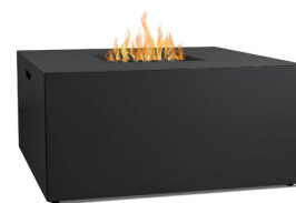
PORTER SQUARE FIRE TABLE W 42" / D 42" / H 20" / 10" DIAM. HALO BURNER LP 40,000 BTU 100 LBS / CHARCOAL FINISH