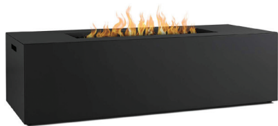
PORTER RECTANGLE FIRE TABLE W 72" / D 28" / H 20" / 30" LINEAR BURNER LP 65,000 BTU 117 LBS / CHARCOAL FINISH