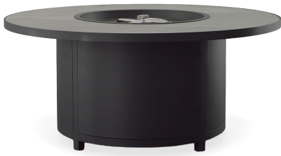
CAPRI CHAT 54" ROUND W 54" / D 54" / H 24" / BURN PAN 24" LP OR NG 60,000 BTU / 254 LBS