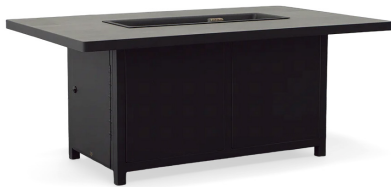
CAPRI CHAT 58" X 36" W 58" / D 36" / H 24" / BURN PAN 30" X 10" LP 60,000 BTU / NG 62,500 BTU / 251 LBS