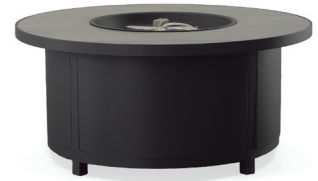
CAPRI OCCASIONAL 42" ROUND W 42" / D 42" / H 19" / BURN PAN 20" LP OR NG 60,000 BTU / 192 LBS