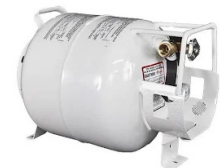
HORIZONTAL LP TANK H 12" / DIAMETER 12.2" 4.6 GALLON CAPACITY