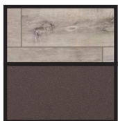
BUCKSKIN TILE SABLE FINISH