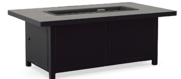
CAPRI OCCASIONAL 50" X 30" W 50" / D 30" / H 19" / BURN PAN 30" X 10" LP 60,000 BTU / NG 62,500 BTU / 200 LBS