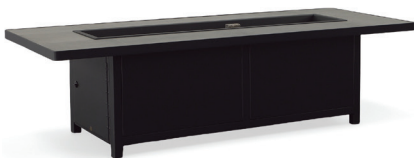
CAPRI OCCASIONAL 72" X 28" W 72" / D 28" / H 19" / BURN PAN 50" X 10" LP OR NG 65,000 BTU / 293 LBS