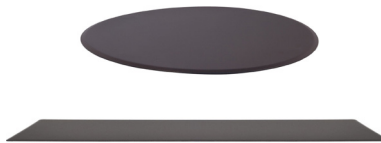
BURNER LIDS AVAILABLE TO FIT: 20" / 24" ROUND 30" X 10" / 50" X 10" RECTANGLE BURN PANS