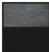
URBAN SHIFT TILE GRAPHITE FINISH