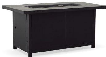
CAPRI CHAT 50" X 30" W 50" / D 30" / H 24" / BURN PAN 30" X 10" LP 60,000 BTU / NG 62,500 BTU / 208 LBS