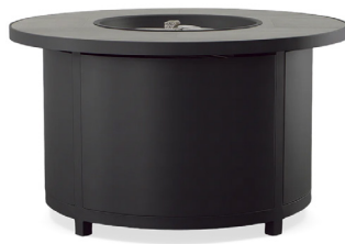
CAPRI CHAT 42" ROUND W 42" / D 42" / H 24" / BURN PAN 20" LP OR NG 60,000 BTU / 198 LBS