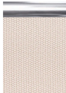
POLISHED SILVER FRAME LINEN