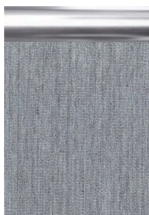
POLISHED SILVER FRAME PLATINUM