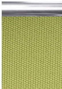
POLISHED SILVER FRAME PISTACHIO