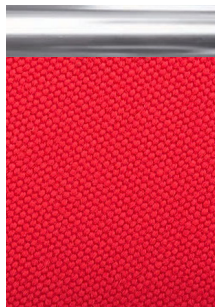
POLISHED SILVER FRAME LOGO RED