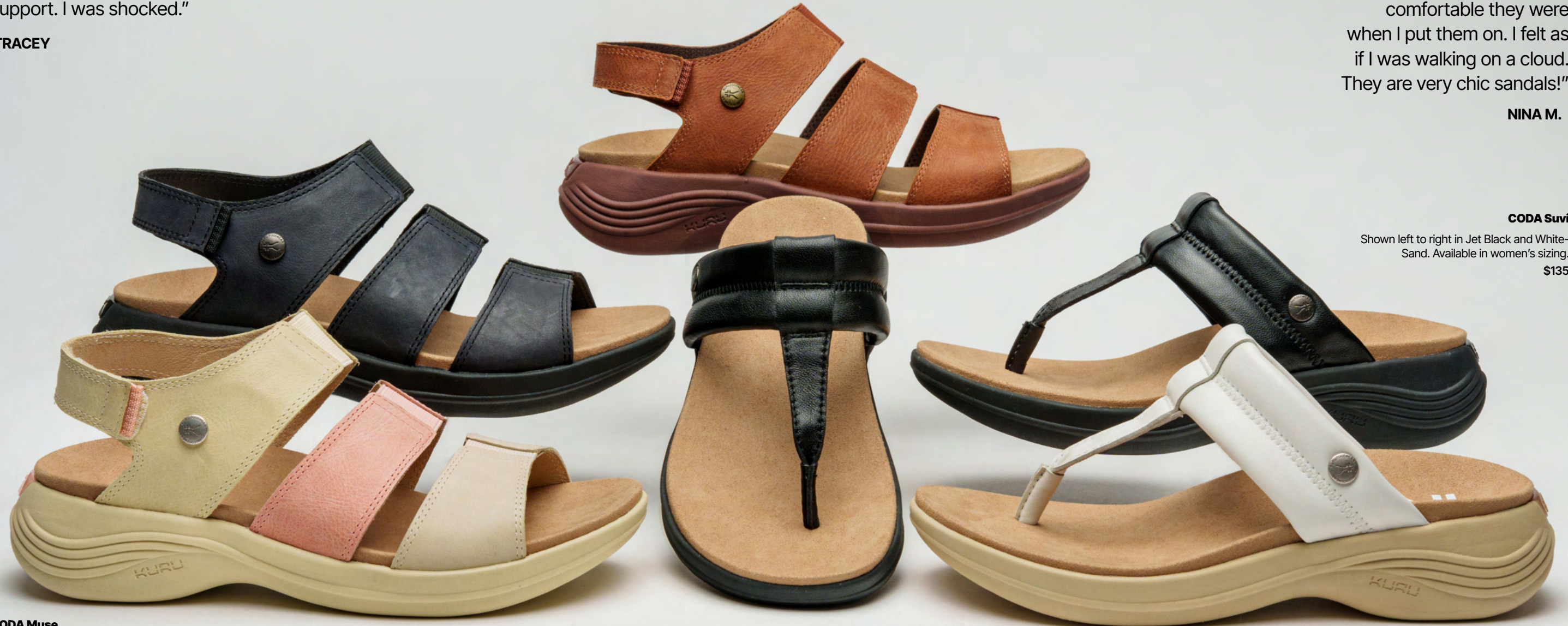
CODA Muse Shown top to bottom in Cognac Brown, Jet Black, and Straw-Light Peach. Available in women's sizing. $140