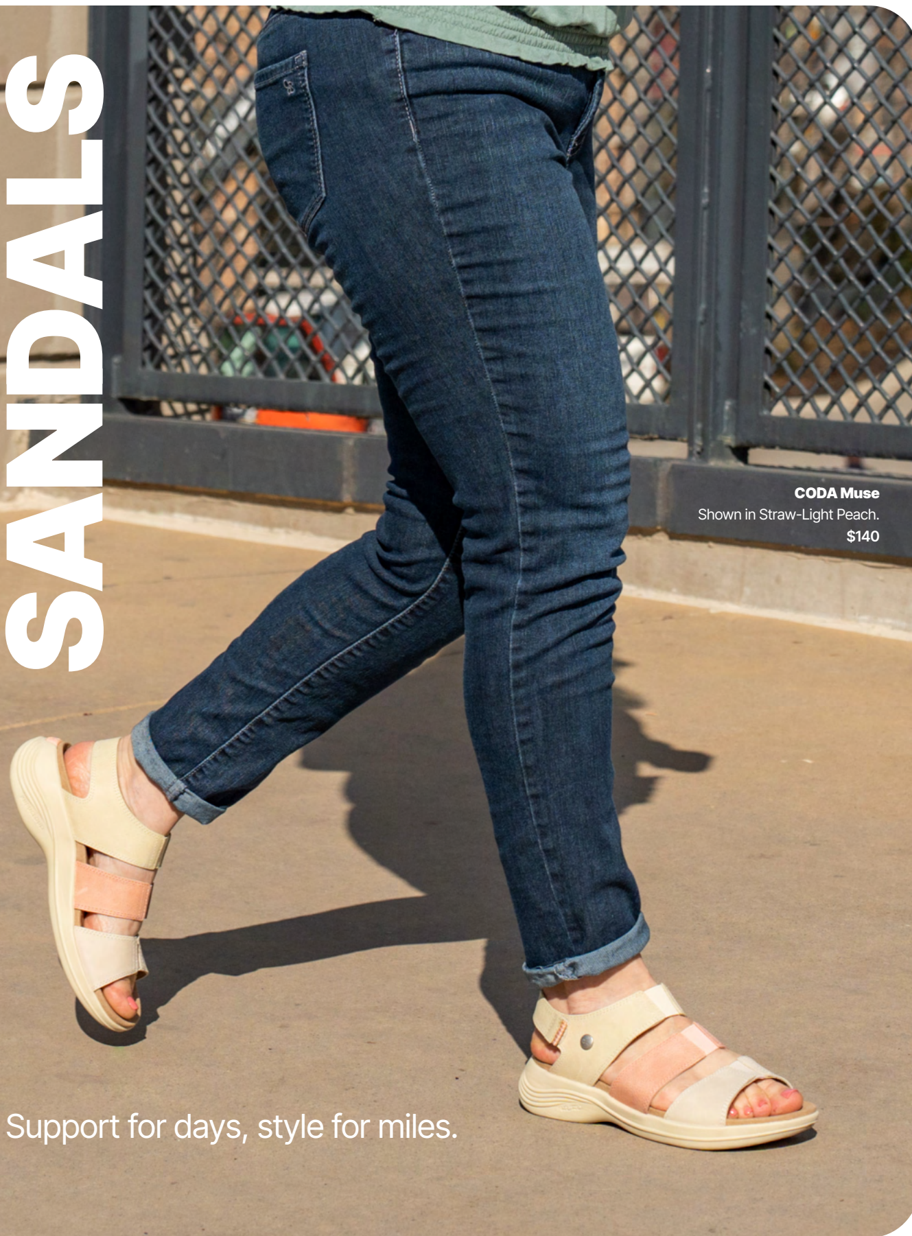
CODA Muse Shown in Straw-Light Peach. $140