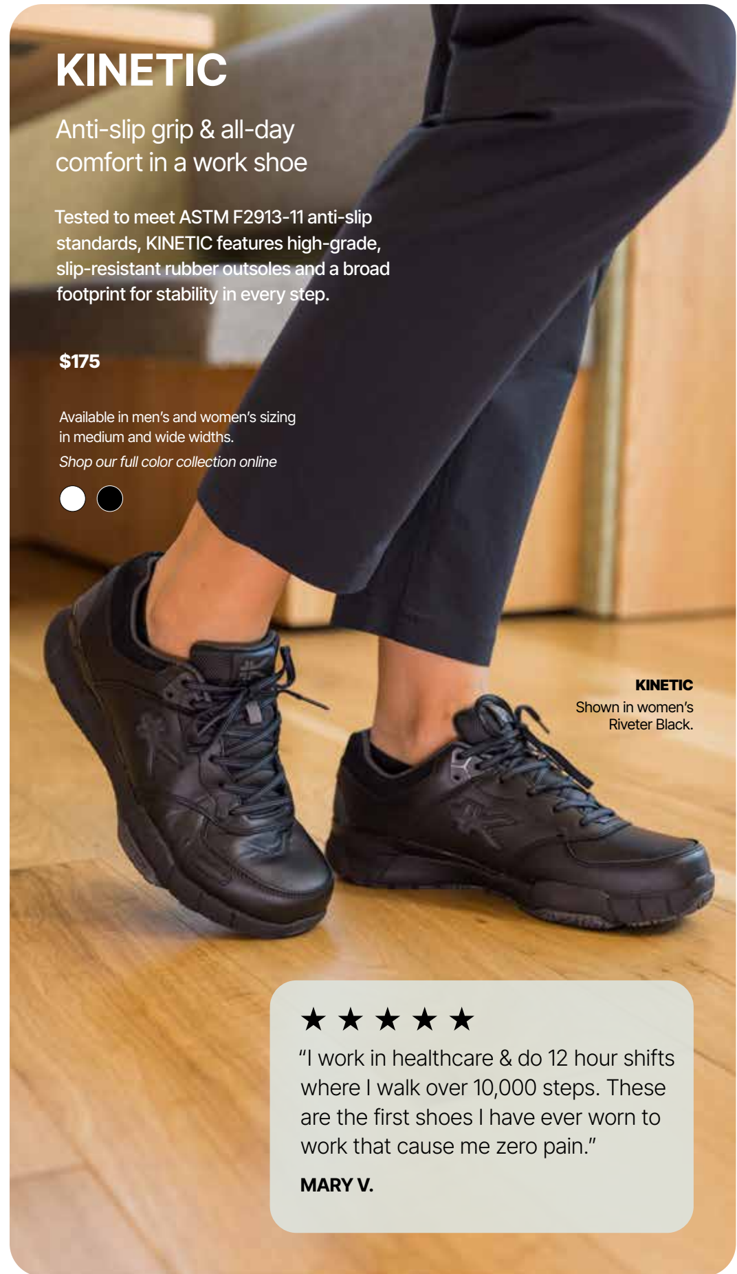
KINETIC Shown in women's Riveter Black.