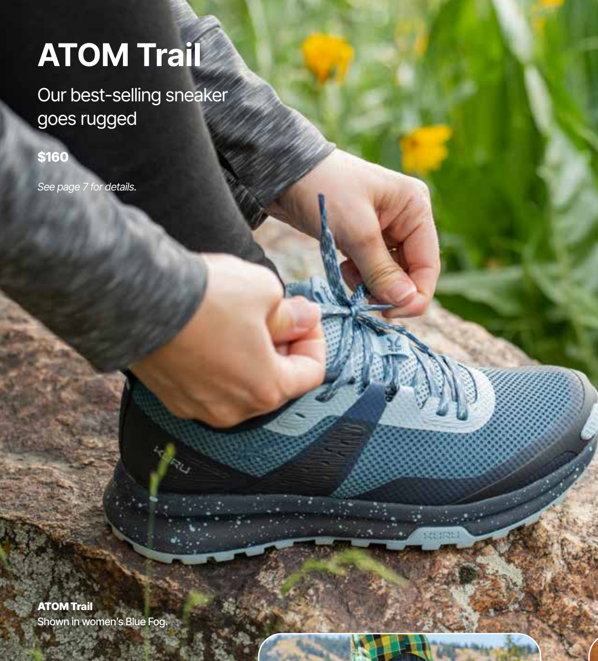
ATOM Trail Shown in women's Blue Fog.