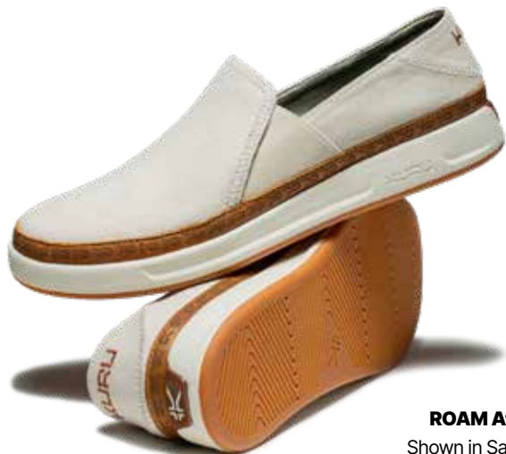
ROAM Atla Shown in Sand.