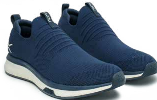
ATOM Slip-On Shown in men's Midnight Blue.