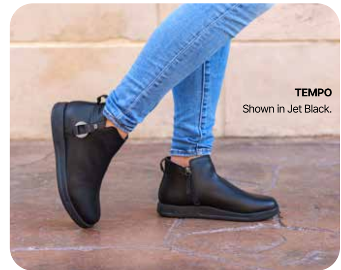
TEMPO Shown in Jet Black.