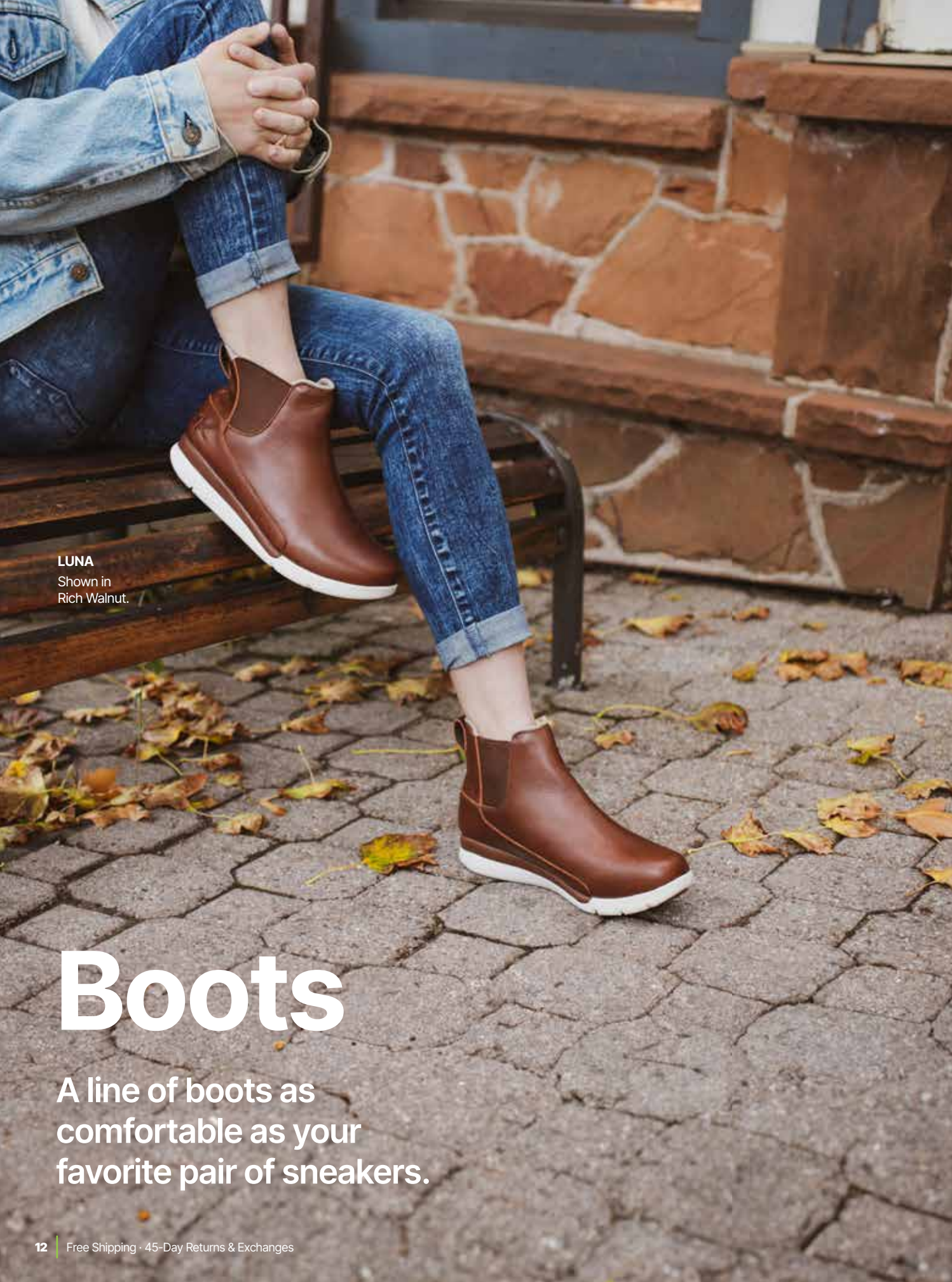
LUNA Shown in Rich Walnut.