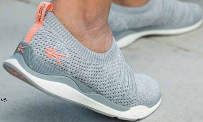
STRIDE Shown in Heather Gray.