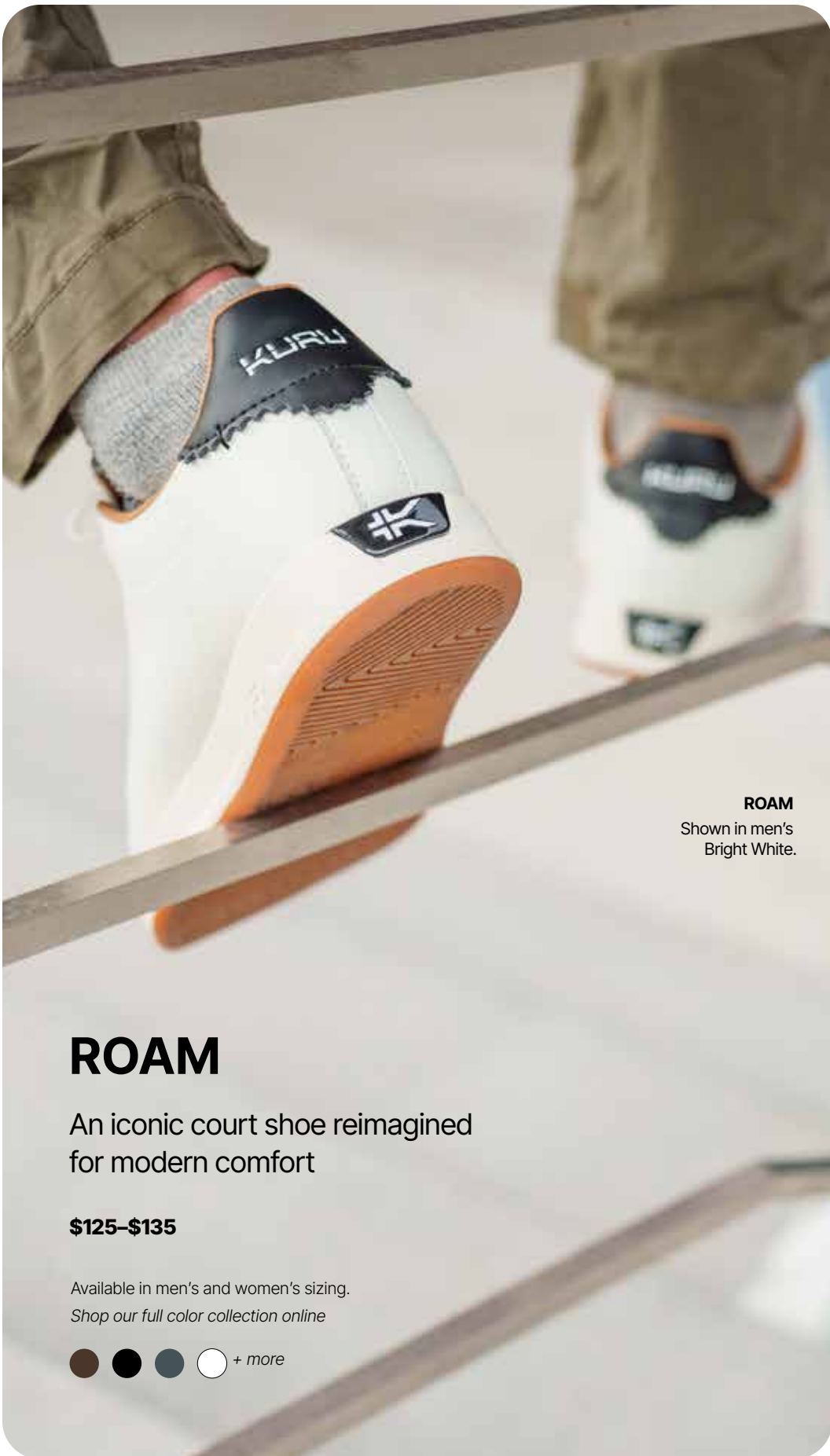
ROAM Shown in men's Bright White.