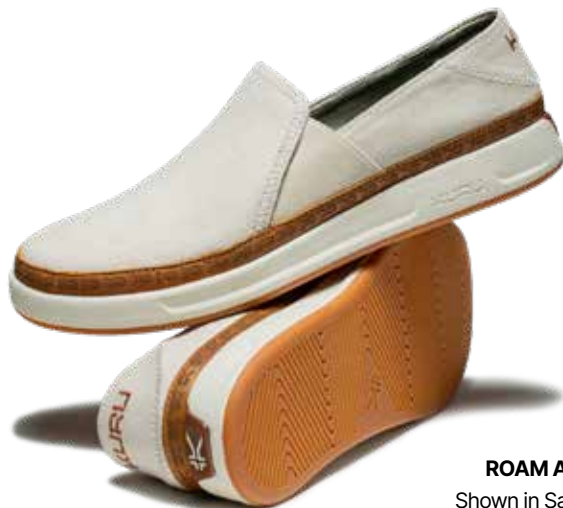
ROAM Atla Shown in Sand.