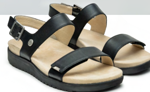
Left row, top to bottom: women's ATOM Slip-On , Page 30; men's ATOM Slip-On , Page 30; women's ATOM Trail , Page 15; men's ATOM Trail , Page 15. Middle row, top to bottom: women's CODA Suvi , Page 24; men's CURRENT , Page 25. Right row, top to bottom: men's COVE , Page 28; women's STRIDE Move , Page 14; women's CODA Muse , Page 23; women's LOFT , Page 32. Bottom left: women's GLIDE , Page 21.