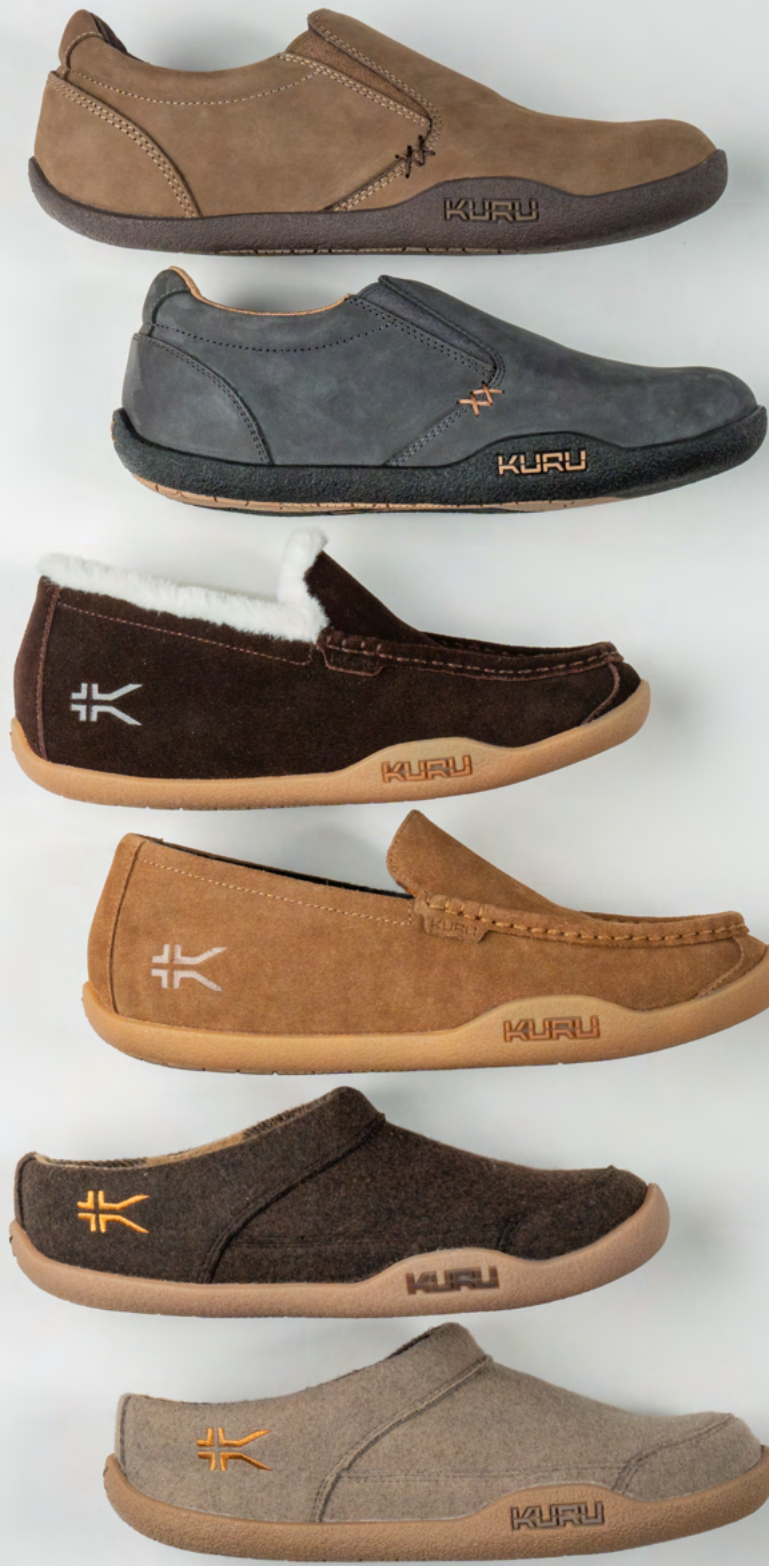
Shown top to bottom: women's KIVI in Warmstone $165; women's KIVI in Lead Gray $165; women's LOFT in Java Brown $140; men's LOFT in Chestnut $140; women's DRAFT in Cocoa Brown $135; women's DRAFT in Sand $135. Each shoe available in men's and women's sizing. KIVI also available in wide. See our full color collection online.

This isn't your average slipper. DRAFT is made with a backless design, sturdy rubber outsole, and KURU's dreamy built-in support for pain relief you can count on.