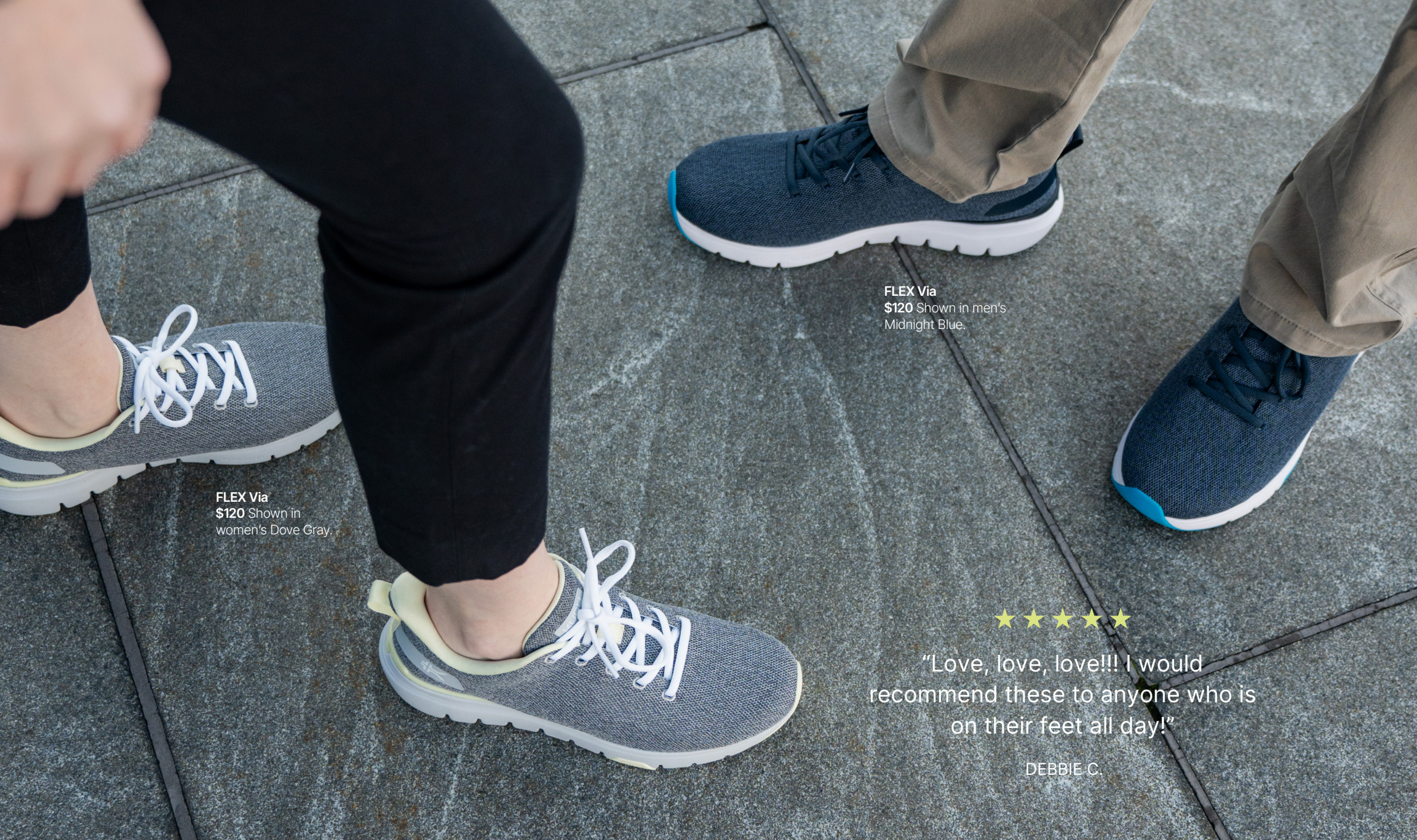
FLEX Via $120 Shown in women's Dove Gray.