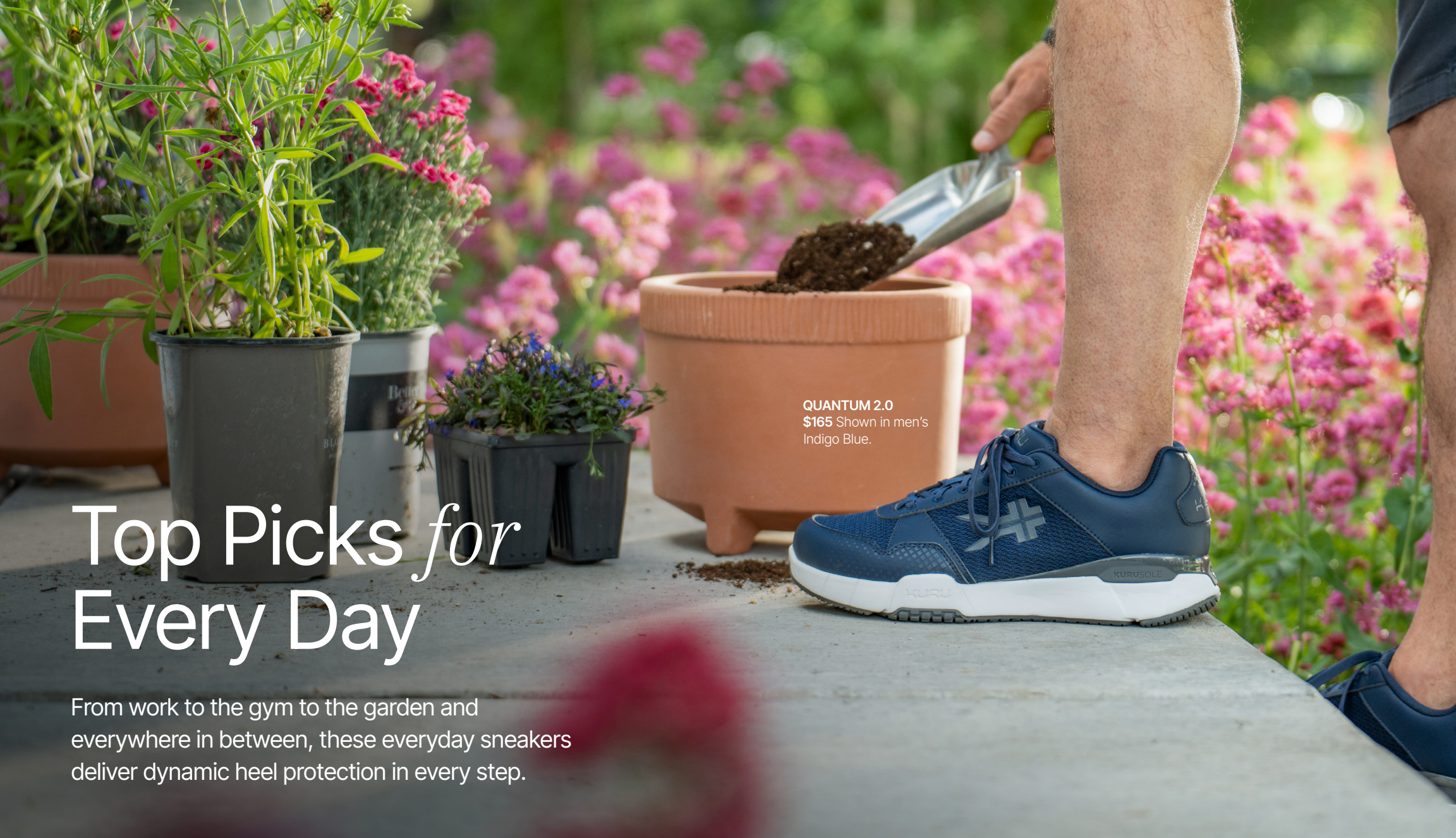
QUANTUM 2.0 $165 Shown in men's Indigo Blue.