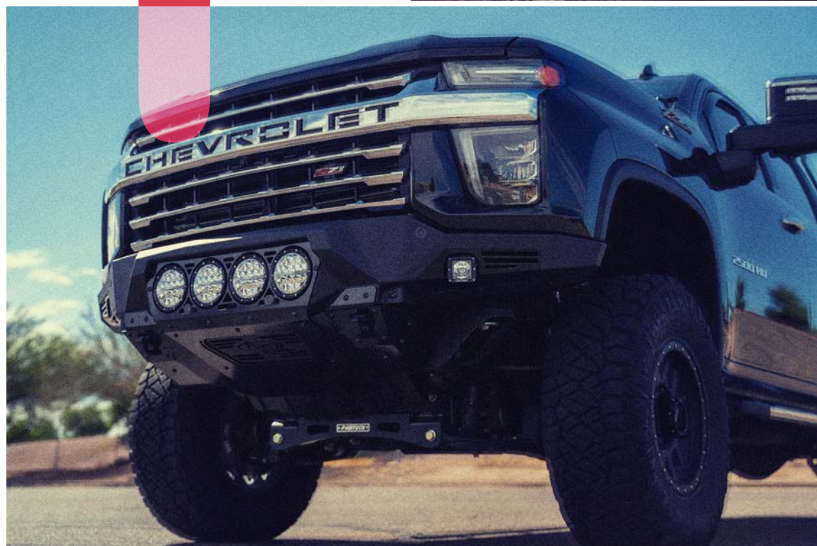
2020 - 2022 CHEVY 2500/3500 BOMBER FRONT BUMPER