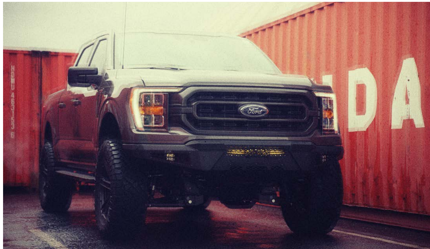
2021-2023 FORD F-150 HONEYBADGER FRONT BUMPER

We are now able to react to your requests to bring back some of our Heritage Products, delivering them to our consumers on a made to order basis. Because we are also enthusiasts, it is important to us to support the makes and models ADD was built on and ensure the aftermarket support for these communities does not go extinct. We will be re-releasing products weekly with a heavy focus on prior generations of staple offroad trucks, such as the first generation Raptor. The Heritage Collection will feature many of our classic designs crafted with the same attention to detail and quality that you've come to expect and rely on from Addictive Desert Designs.