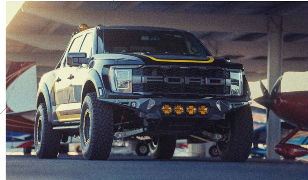
2021-2023 FORD RAPTOR BOMBER FRONT BUMPER [RIGID]