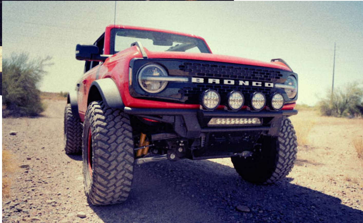
2021-2023 FORD BRONCO ADD PRO BOLT-ON FRONT BUMPER