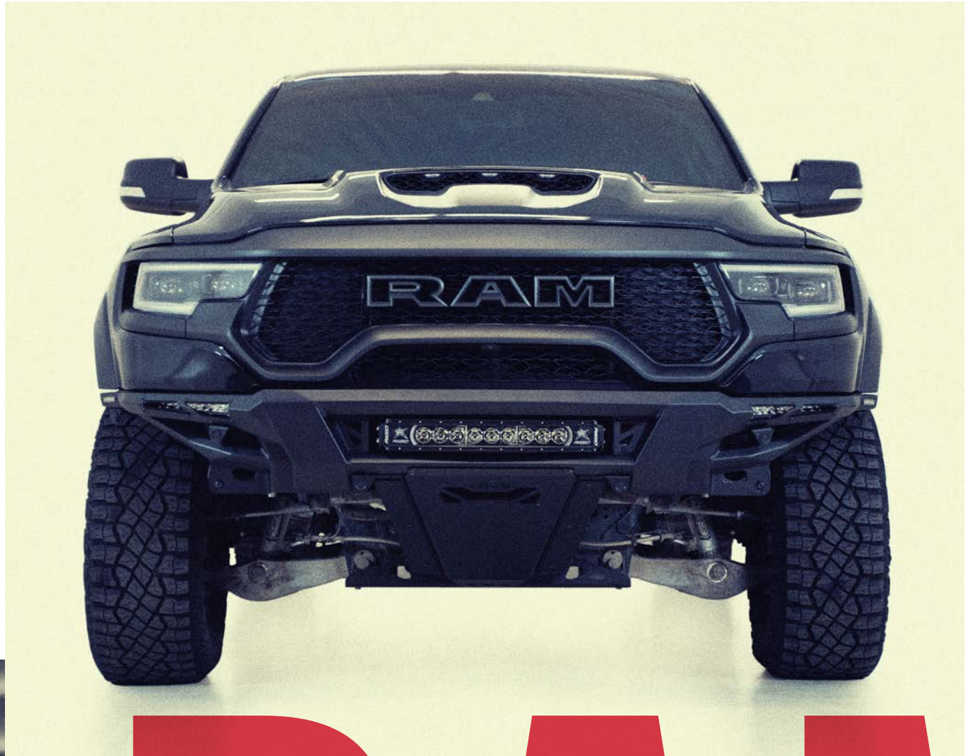
2021-2023 RAM 1500 TRX PHANTOM FRONT BUMPER + PHANTOM REAR BUMPER