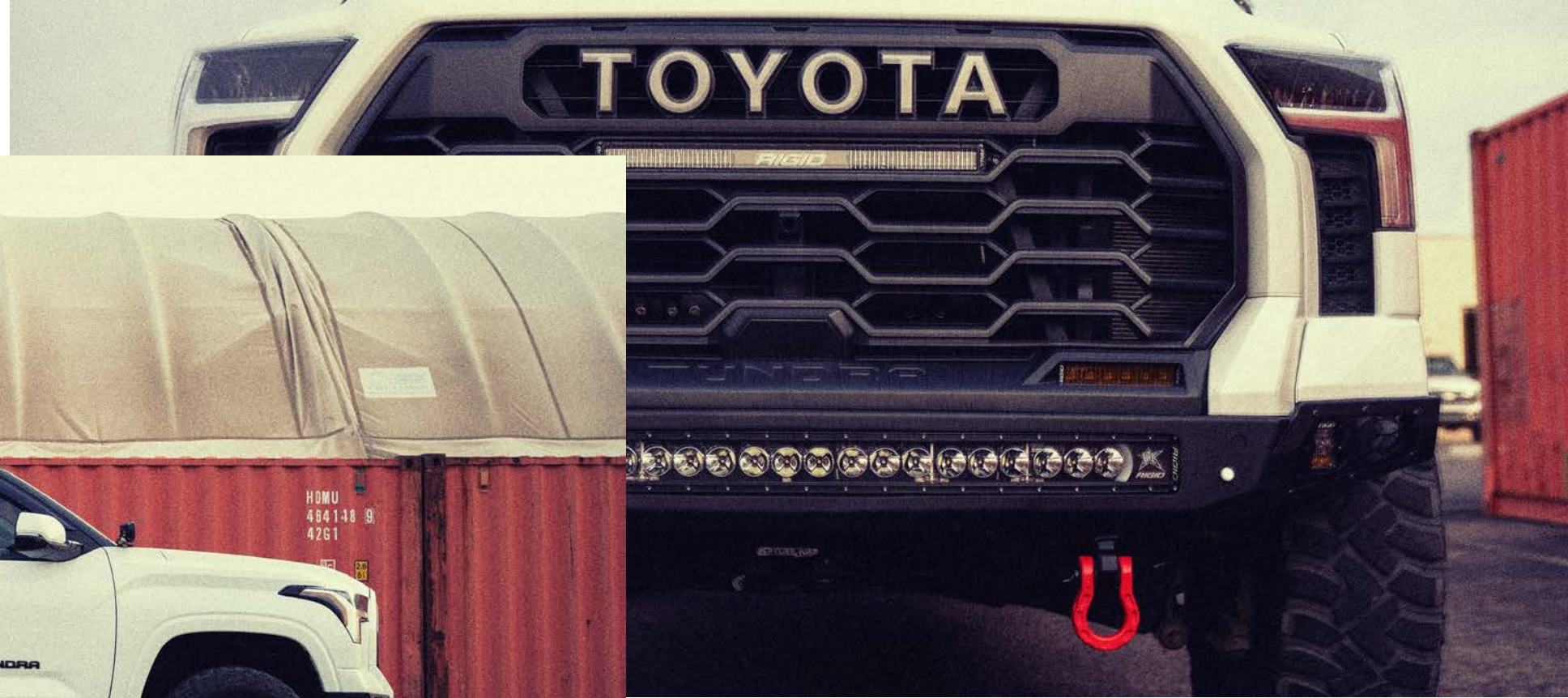
2022-2023 TOYOTA TUNDRA STEALTH FIGHTER WINCH FRONT BUMPER