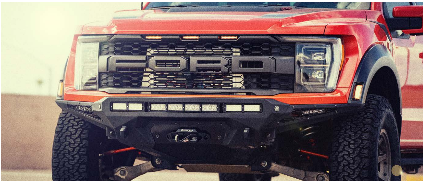
2021-2023 FORD RAPTOR STEALTH FIGHTER FRONT BUMPER