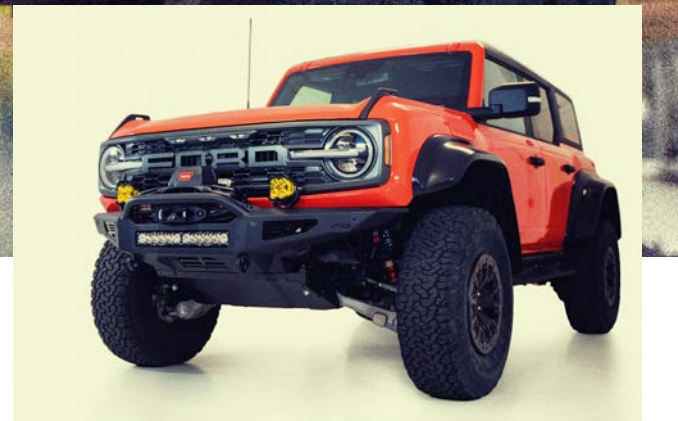
2022-2023 FORD BRONCO RAPTOR ROCK FIGHTER FRONT BUMPER