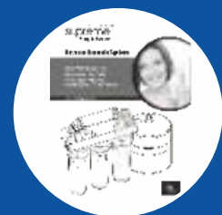
They include a detailed manual