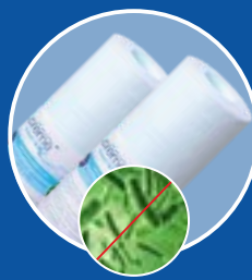
They included bacteriostatic, mechanical cartridges