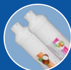
They included cartridges of QC type (quick-release coupling)