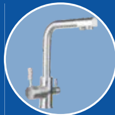
They may be connected to three-way faucets of SUPREME brand*