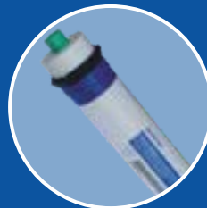
They contain the market leading original PENTAIR/USA membrane – 75 GPD