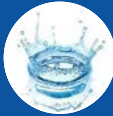
Remove of mechanical impurities (sand, mud, suspensions)