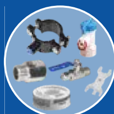
They include accessories necessary for correct installation