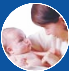
Safe for small children, infants and pregnant women