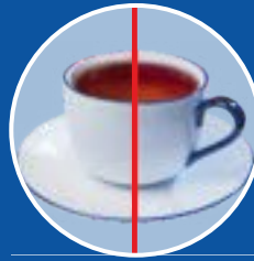
Perfect taste of drinks and foods