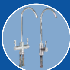
They are equipped with modern and stylish sprouts