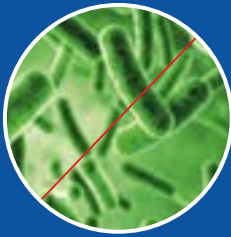
Protection against bacteria and viruses