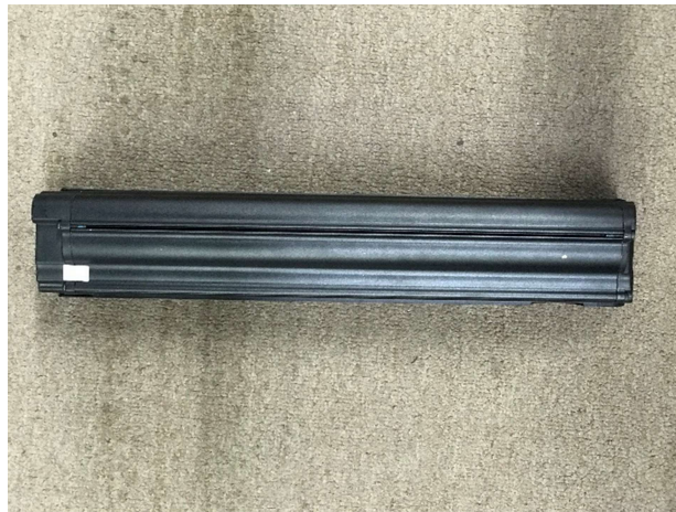
Atlas Cruiser 48V Battery

*IMPORTANT – The frame-integrated battery is installed and removed from the bottom of the frame. The front wheel must be turned to one side to allow enough room for the installation or removal of the battery.