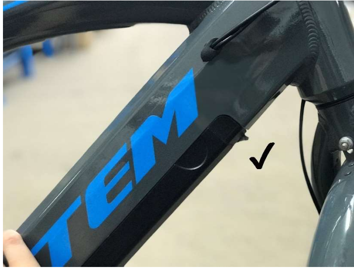
Correctly installed battery