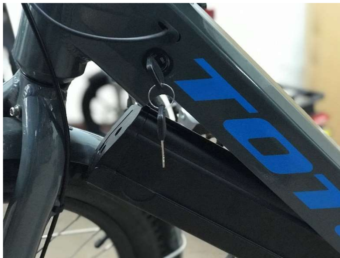
Battery Removal with key