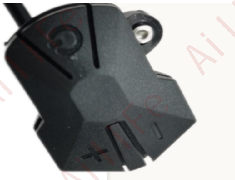
Table: Line sequence of the label connector table