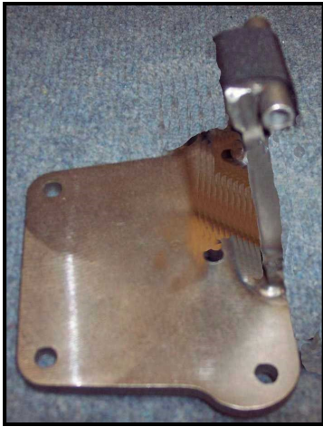
Utopia Built in Driver Backrest Bracket.

← Remove your seat and place on your work-bench, with bottom up. Slide Bracket into Slit that is in Bottom of Your Seat, that comes out the Top of Seat.