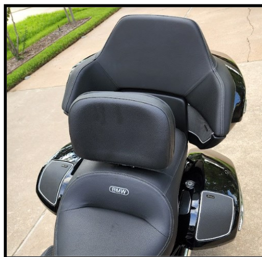
Front view of pad installed on BMW R-18

A driver's backrest that becomes part of your seat. No bars in the way of the driver's hips and legs or passenger's legs. Folds forward to ease passenger getting on or off and adds to safety by getting out of the way in sudden stops. Includes up and down height adjustments, as well as driver seating position, back and forth, to help driver sit upright to avoid slouching, a big factor in driver fatigue.