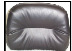
2001 up except Midnight

A driver's backrest that becomes part of your seat. No bars in the way of the driver's hips and legs or passenger's legs. Folds forward to ease passenger getting on or off and adds to safety by getting out of the way in sudden stops. Includes up and down height adjustments, as well as driver seating position, back and forth, to help driver sit upright to avoid slouching, a big factor in driver fatigue.