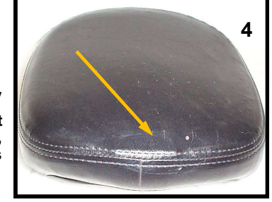
Now see Bar under reinstalled cover.