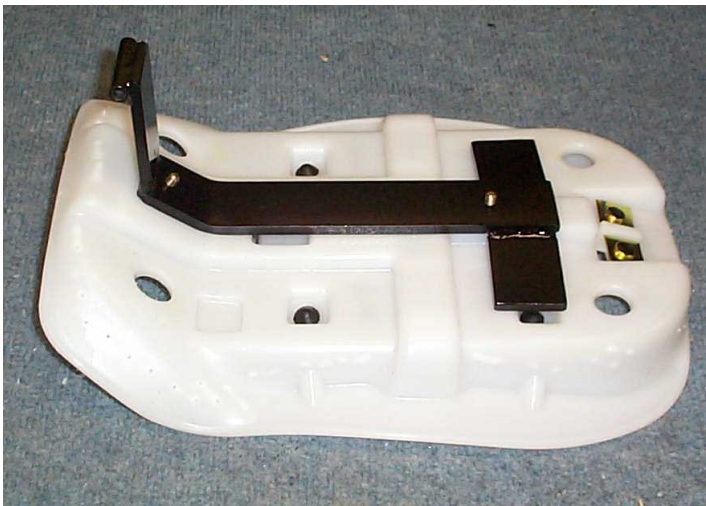
Kawaski 1600 Nomad