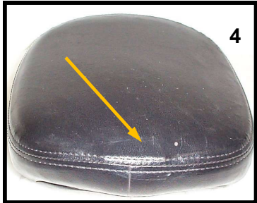
Now see Bar under reinstalled cover.

6. Bend and shape the peel and stick boot and install, as shown in picture 6.