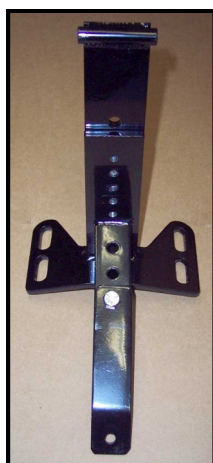
← Older Models