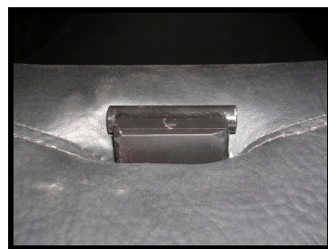
Inside Bar No More Than 1/2" Above Seat