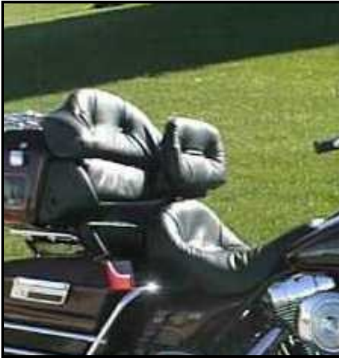
From Full Dress Ultra