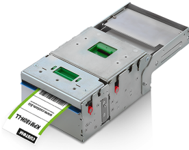
915AH030700700 PRINTER KPM180H-LL UHF RFIDCUT PRES ETH USB RS232 AVIATION

Via Berettine, 2 - 43010 Fontevivo PR - VAT: IT02498250345 - TEL: +39 0521 680111 - FAX: +39 0521 610701 - UNIQUE CODE: 8RQN7AZ