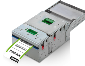
915AH021800700 PRINTER KPM180H UHF RFID CUT ETH USB RS232 AVIATION

Via Berettine, 2 - 43010 Fontevivo PR - VAT: IT02498250345 - TEL: +39 0521 680111 - FAX: +39 0521 610701 - UNIQUE CODE: 8RQN7AZ