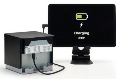
Sync & Charge with USB-C