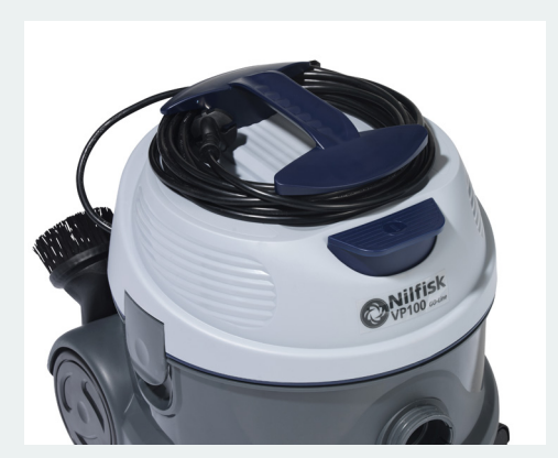
Intuitive cord storage