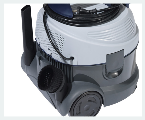
Ergonomic and easy to reach accessory parking

The VP100 is fully compatible with the range of accessories offered with the rest of the Nilfisk dry canister vac portfolio. It allows to be more flexible in replacement of accessories and reduce the overall operating costs of your complete Nilfisk cleaning solution.