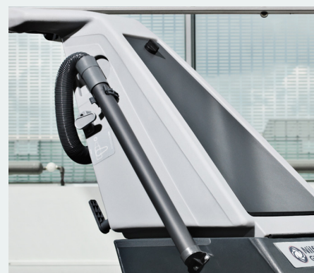
Simple controls and low profile design make operating the unit easier and safer