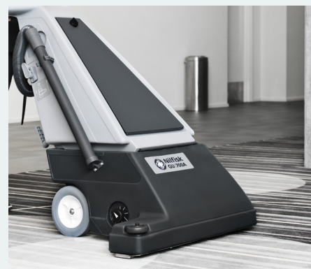
65 cm wide path cleaned in one pass

Specifications and details are subject to change without prior notice.