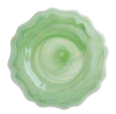
Glass Dinner Plate Green 16,90 EUR