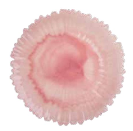
Glass Serving Platter Soft Pink 22,90 EUR