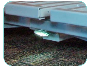
Underbed lights illuminate below Smart Stop level.