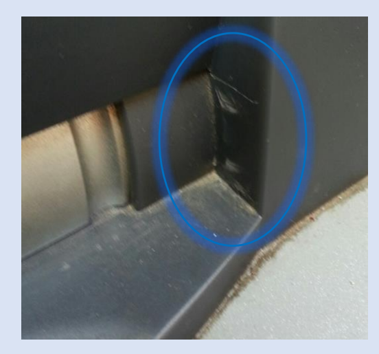
Scuff marks showing where device was fitted