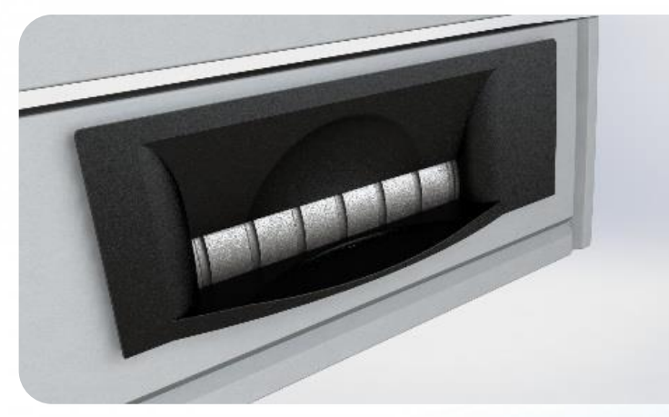
Cash slot with cleats fitted