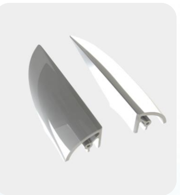
Anti Cash-Trapping cleats