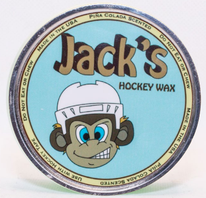
Pina Colada Wax