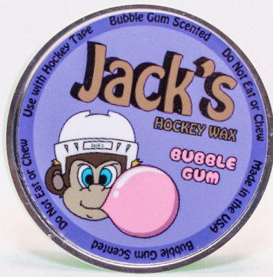
Bubble Gum Wax