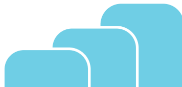
Dome Regular / Tall / Extra Tall