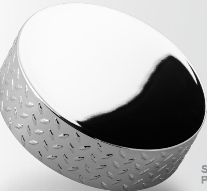
Steel Plate Pattern.