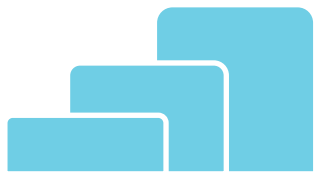
Smooth Sided Regular / Tall / Extra Tall