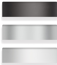
Smooth Matte (Black, White, Metalized)