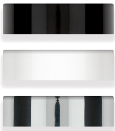
Smooth Gloss (Black, White, Metalized)