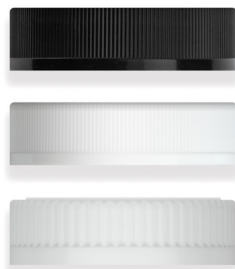
Ribbed (Black, White, Pictorial)