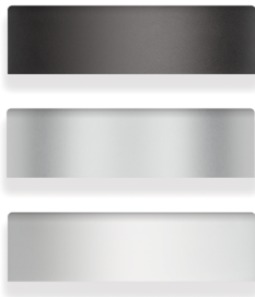
Smooth Matte (Black, Metalized, White)