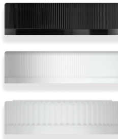
Ribbed (Black, White, Pictorial)