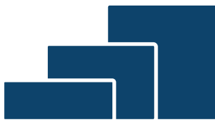
Smooth Sided Regular / Tall / Extra Tall