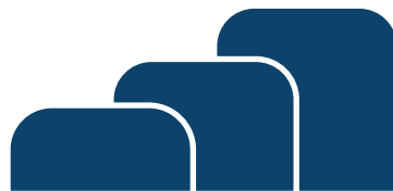
Dome Regular / Tall / Extra Tall