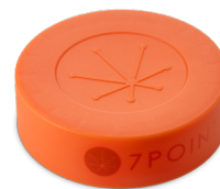
Debossed or Embossed Closure

Achieve detailed, multi-color decoration with labels on jars and closures.