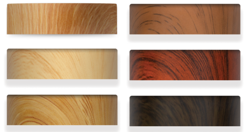
Wood Grain Printed (Honey, Ash, Bamboo, Walnut, Redwood, Ebony)