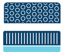
Ribbed Tamper Evident