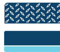
Smooth Sided Tamper Evident