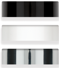
Smooth Gloss (Black, White, Metalized)