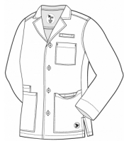
Cuffless Lab Jacket