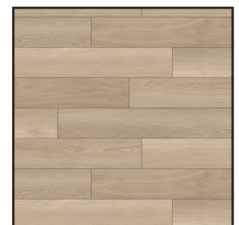
PARIS | VYEPR748