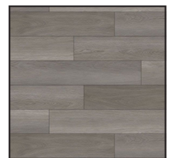
ROME | VYERM748