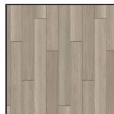
PRAGUE | VYEPG748