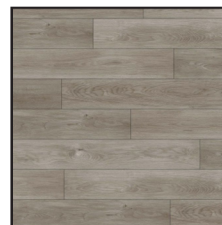
MILAN | VYEM748