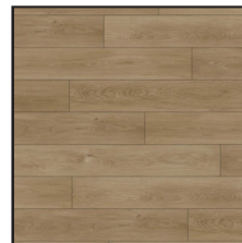
DUBAI | VYEDB748