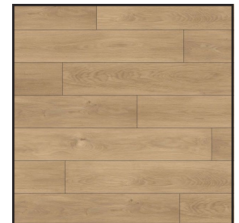
BERLIN | VYEBE748