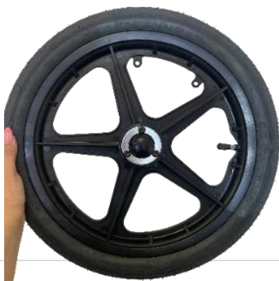
Outside of Rear wheel