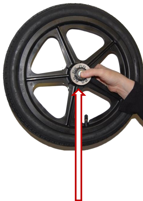
Big button on the quick release Axle