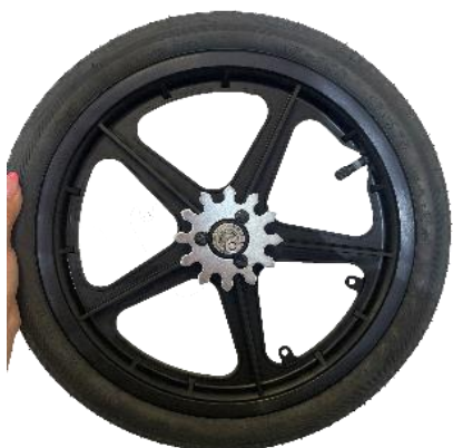
Inside of Rear wheel

To install or remove the rear wheels simply push the button on the outside of the wheel and hold it in while either installing it into the AXIOM axle or removing it. Be sure the rear foot brake is in the upright position when installing or removing the wheels.