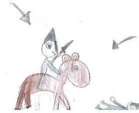
The Battle of Hastings