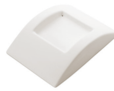
One Candle Bridge

8539: 19.8" x 12.8" x 1.8" (50 x 33 x 5 cm) ▶ 300°F | 1225°F | 1:45