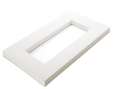
Rectangular Drop Out

8957: 9.5" x 9.5" x 0.7" (24 x 24 x 2 cm); Inside 5.4" x 5.4" (14 x 14 cm) ▶ 300°F | 1250°F | 1:30*