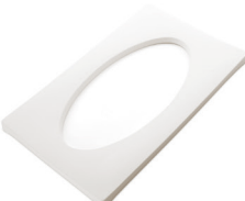
Ellipse Drop Out

8454: 9.1" x 6.1" x 1.5" (23 x 16 x 4 cm) ▶ 300°F | 1250°F | 1:30