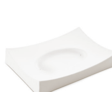
Oval in Rectangle

8924: 12.2" x 7.4" x 1.7" (31 x 19 x 4 cm) ▶ 300°F | 1200°F | :05 8925: 14.8" x 7.4" x 1.7" (38 x 19 x 4 cm) ▶ 300°F | 1200°F | :05 8929: 16.5" x 11.9" x 2" (42 x 30 x 5 cm) ▶ 300°F | 1170°F | :05