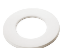
Drop Out Ring

* This schedule is for making a shallow plate. The mold is placed directly on the kiln shelf—not elevated.