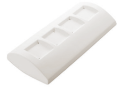
Four Candle Bridge

8903: 7.2" x 5.1" x 2" (18 x 13 x 5 cm) ▶ 300°F | 1250°F | 1:30