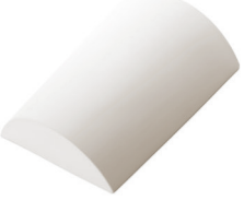
Lamp Bender Conic

8960: 9.4" x 8.7" x 1.7" (24 x 22 x 4 cm) ▶ 300°F | 1220°F | :10 8643: 15.9" x 13.6" x 2.9" (40 x 35 x 7 cm) ▶ 300°F | 1215°F | :10