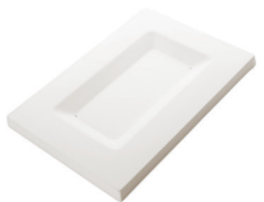
Soft Edge Platter Long

8932: 13.5" x 9.7" x 1.4" (34 x 25 x 4 cm) ▶ 300°F | 1225°F | :45