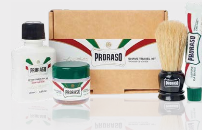
PRORASO TRAVEL SHAVING KIT

Don't settle for less when you travel: this kit contains everything you need for the perfect shave, from both pre-shave and shaving creams to aftershave balm and a mini shaving brush.