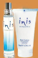
INIS TRAVELER DUO