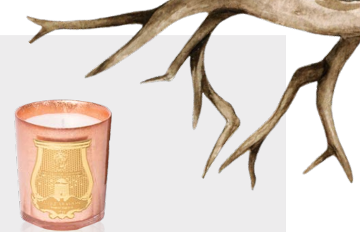
CIRE TRUDON ROSE GOLD LIMITED EDITION CANDLE

Cire Trudon knows a thing or two about candles: the French brand dates back to 1643, and they even supplied Versailles until the revolution. Their festive Limited Edition rose gold candle is perfect for cozy winter days. Available in Abd El Kader and Ernesto.