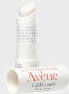
AVÈNE COLD CREAM LIP BALM

From French skincare staple Avène comes a moisturizing lip balm, which not only contains the brand's famous soothing thermal spring water, but also vitamins E and F to nourish and protect.