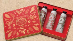
PANIER DES SENS HOLIDAY LIMITED EDITION GIFT SET