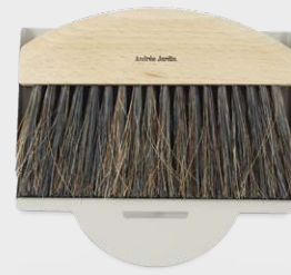
ANDRÉE JARDIN CRUMBER BRUSH AND DUSTPAN SET

Leave it to the French to find a way to make a crumber brush and dust pan set chic. Keep this one on hand to easily sweep away crumbs from the toaster, or flour on the countertops after making cookies.