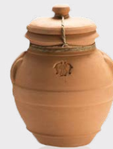
SANTA MARIA NOVELLA POT POURRI IN TERRACOTTA JAR

Enclosed in a terracotta jar, this potpourri smells as good as it looks: it's a mixture of buds, leaves, and flower petals reminiscent of the Tuscan hills.