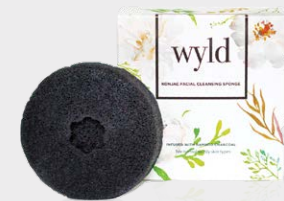
WYLD BAMBOO CHARCOAL KONJAC SPONGE

Keep your complexion clear with this bamboo charcoal sponge. It's not only a natural antibacterial but also exfoliates to keep skin free of clogged pores and flaky skin.