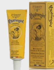
FÉRET HYALINE JELLY FOR HANDS AND FEET

This rose-scented gel is steeped in history—it's been around for more than a century—and is made with organic honey from France, which is incredibly moisturizing for dry hands and feet.