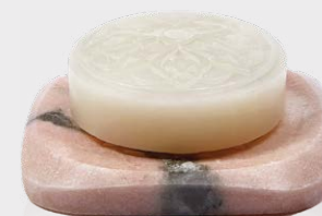
SENTEURS D'ORIENT MA'AMOUL SOAP WITH MARBLE PLATE

This gorgeous set will ensure your soap never looks messy again. The veined gray and pink rosa aurora marble plate is hand-engraved, shaped, and smoothed by artisans in Lebanon, while the soap contains a feminine blend of real roses, geranium, guaiac, litsea, mint, bay, and lime essential oils.