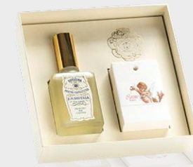
SANTA MARIA NOVELLA PAPERS TO SCENT AND PRESERVE WOOL

Santa Maria Novella has every kind of home fragrance one would need — including lavender and nutmeg-scented papers that you can store in your closet to protect and perfume your clothes.