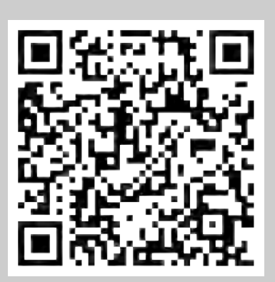
Scan & Save! Scan the QR code, register your product, and get a 6-month Extended Warranty!