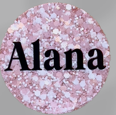
1. Baby Pink Flecks