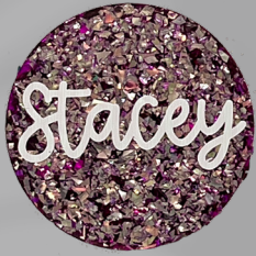
1. Electric Purple