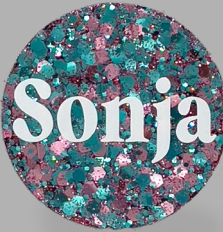
9. Ice Cream