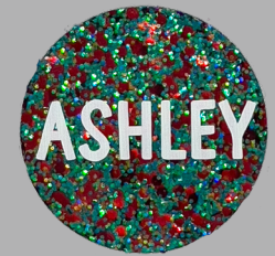
18. Merry Twinkle