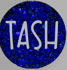
8. Aladdin Nights