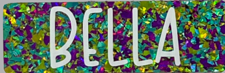
2. Cirtus Twist