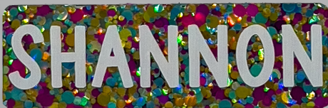
7. Rainbow Balloons