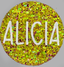
20. Lemon Twist