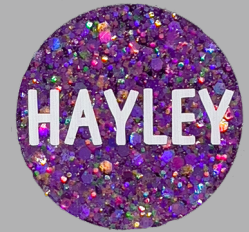
12. Lavender Sparkle