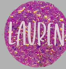
11. Tickled Pink