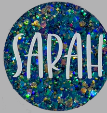
4. Cool Caribbean