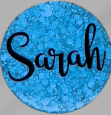
2. Sky Blue