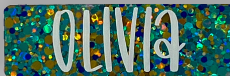
8. Ocean Bubbles