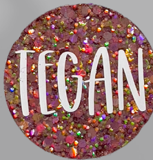
16. Pinky Shower