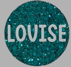
6. Bon Voyage