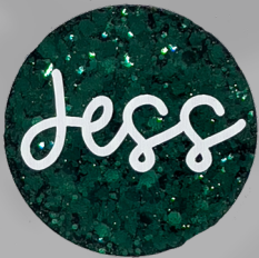
13. Robin Hood