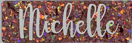
1. Rosie Pink