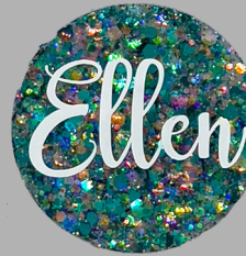
5. Ocean Greens