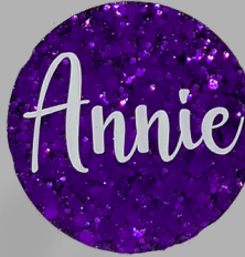
10. Grape Ape