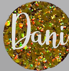
17. Royal Gold