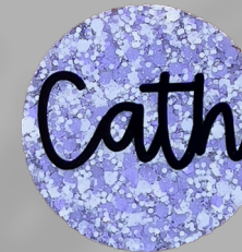
4. Lavender Flecks