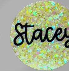
5. Lemon Yellow