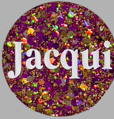
3. Tutti Frutti