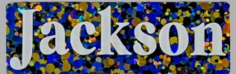
6. Evening Blues