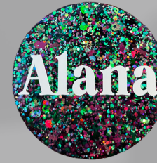
23. Dragons Breath