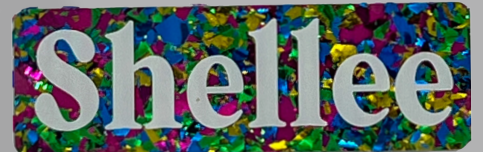
9. Wild Flakes