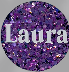
15. Little Mermaid