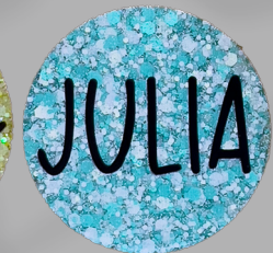
6. Mint Flecks