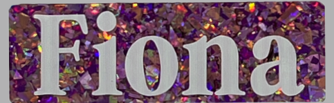
3. Purple Passion