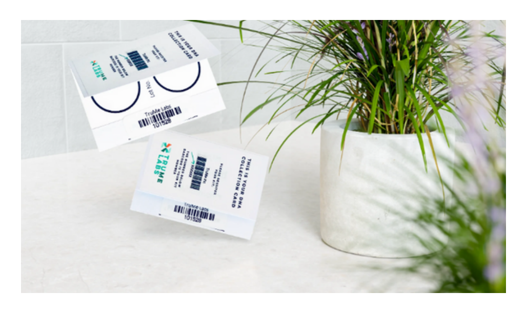
THIS TEST CAN HELP IF