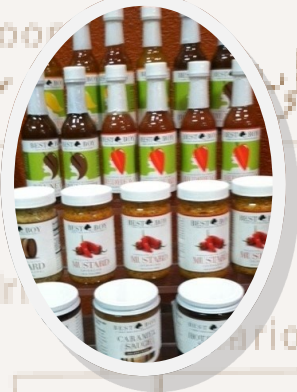
{Best Boy & Co} Roanoke, IN