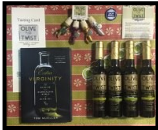
For the Scholar

For free recipes, please go online at: www.theolivetwist.com