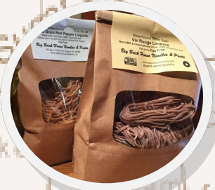
{Pasta} Fort Wayne, IN