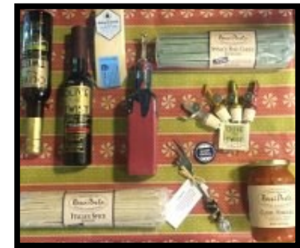
The Pasta Plan