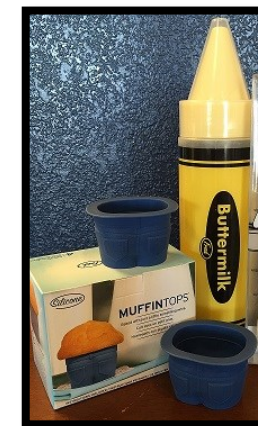
For the Baker or Kids!