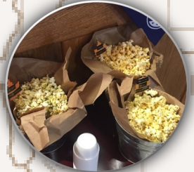
{Popcorn} Berne, IN