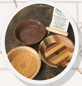
{Wood Pieces} Kendallville, IN