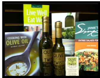
For the Novice , or Expert