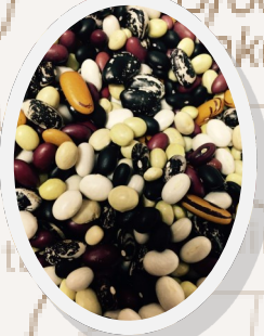
{Beans} Albion, IN