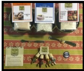
For the Hostess