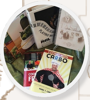
{Cookbooks} Garrett & Fort Wayne, IN