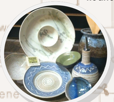
{Pottery} Fremont & Fort Wayne, IN