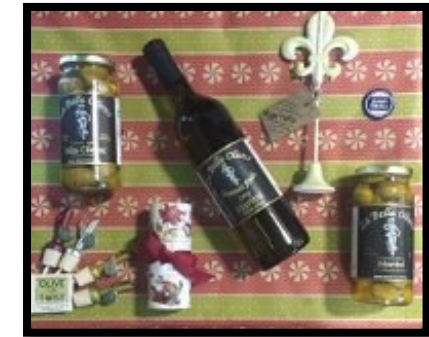
For the Bartender or Hostess