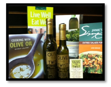
For the Novice , or Expert