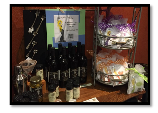
For the Bartender or Hostess

For free recipes, please go online at: www.theolivetwist.com