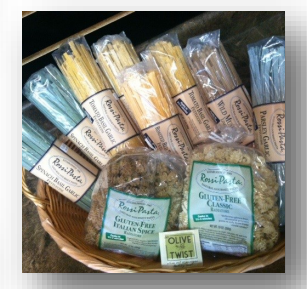
Pasta & Sauce