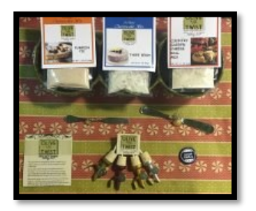
For the Hostess