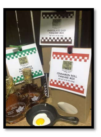
For the Convenience