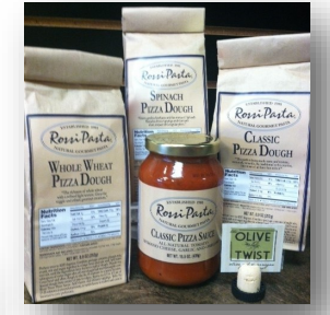
Pizza Crust & Sauce