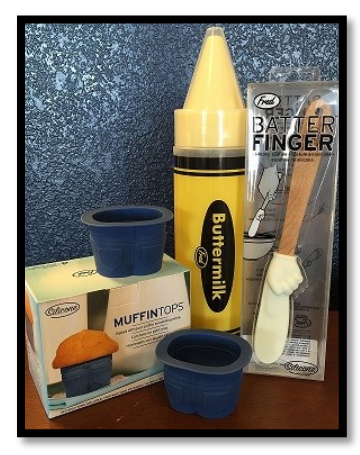
For the Baker or Kids!