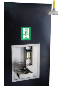
STAINLESS STEEL VERTICAL MOUNT SHOWER WITH 21" PIPE EXTENSION & RECESSED EYE/FACE WASH Model No. S2160-PE21-RA-PAN

This Pedestal-Mounted Emergency Eye/Face Wash has a plastic bowl, ABS plastic eye/face wash spray heads, an inline strainer and a stay-open 1/2" stainless steel ball valve and stainless steel push handle. Often ordered with an ET71-1-BVS-OTG to meet OSHA's tepid water requirements.