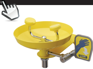
WALL MOUNT EYE FACE WASH Model No. S0420

Click on or tap the product image to access the complete submittal.