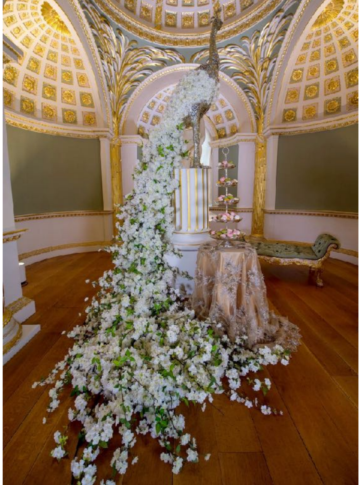
A peacock centrepiece.