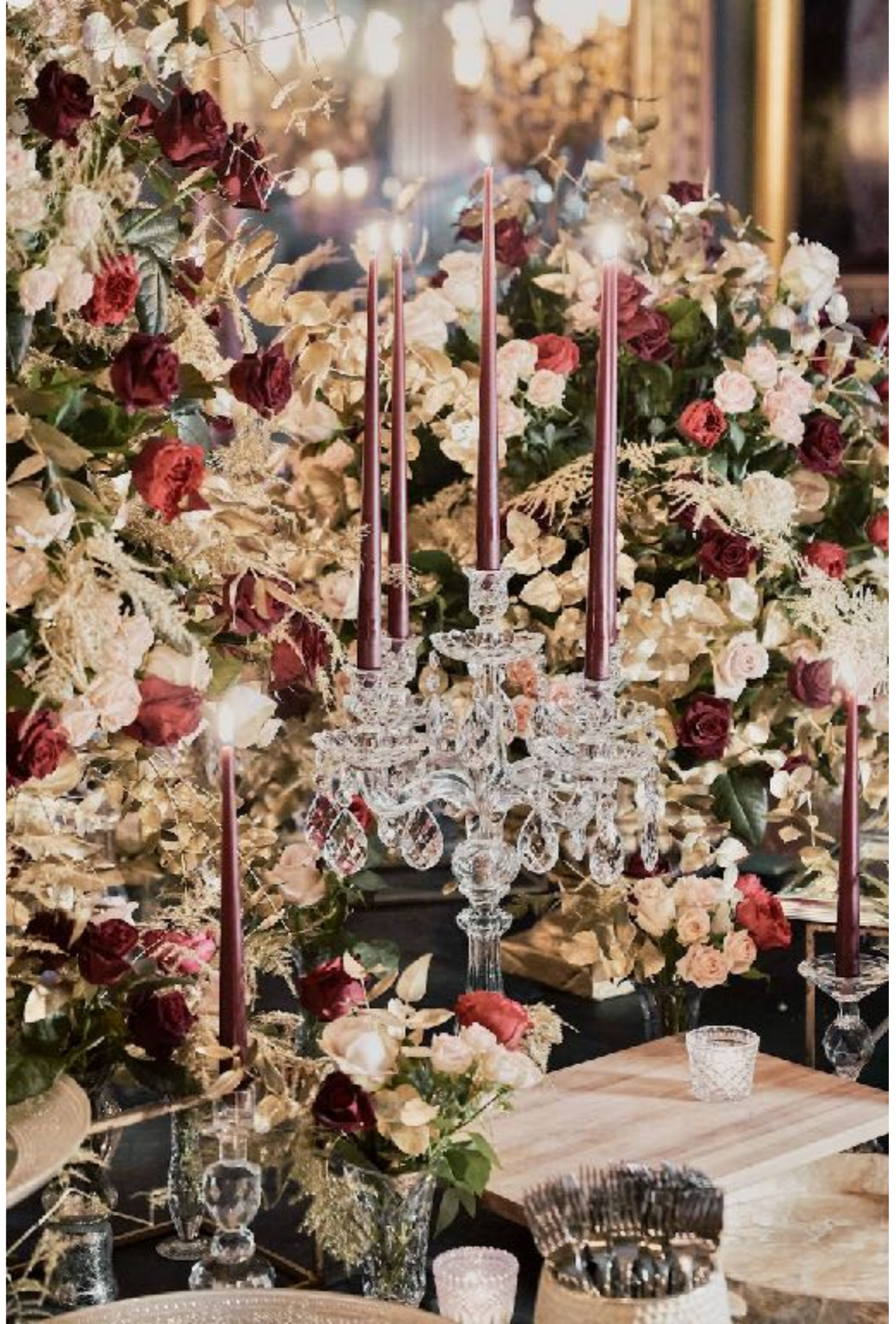
A decoration scheme for a winter party.