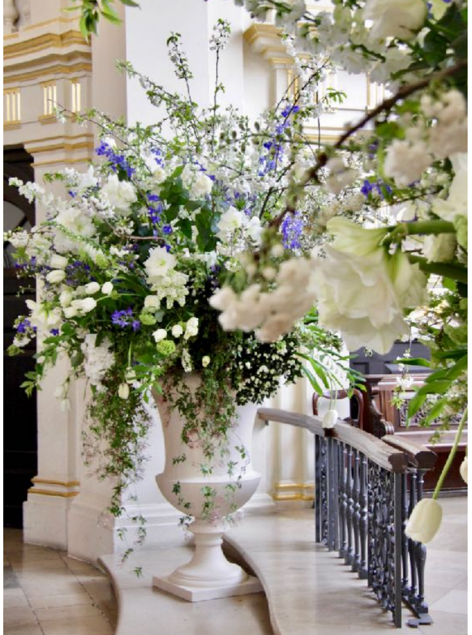
Church flowers; setting the scene for the day.