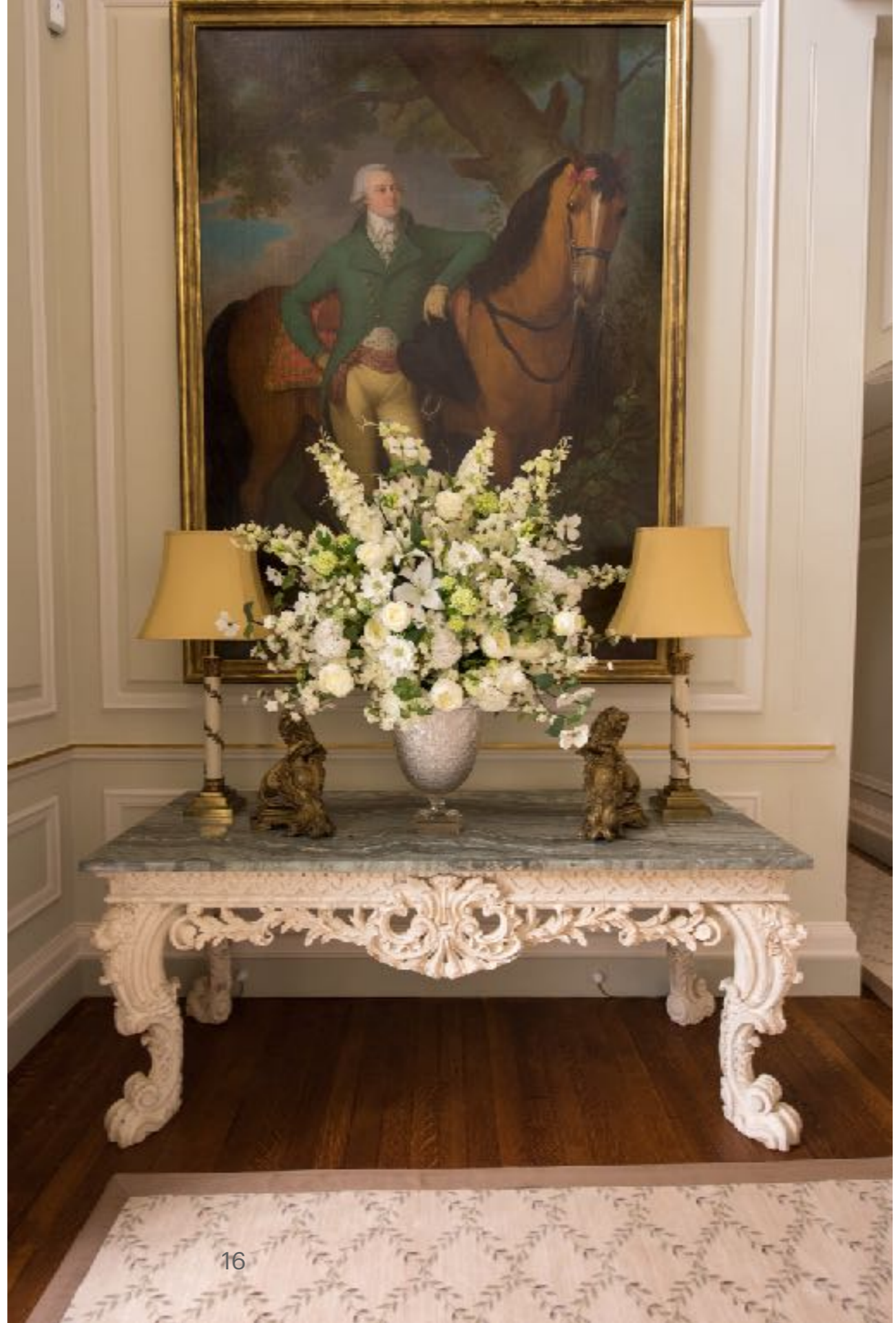
A stunning white arrangement for an entrance hall.