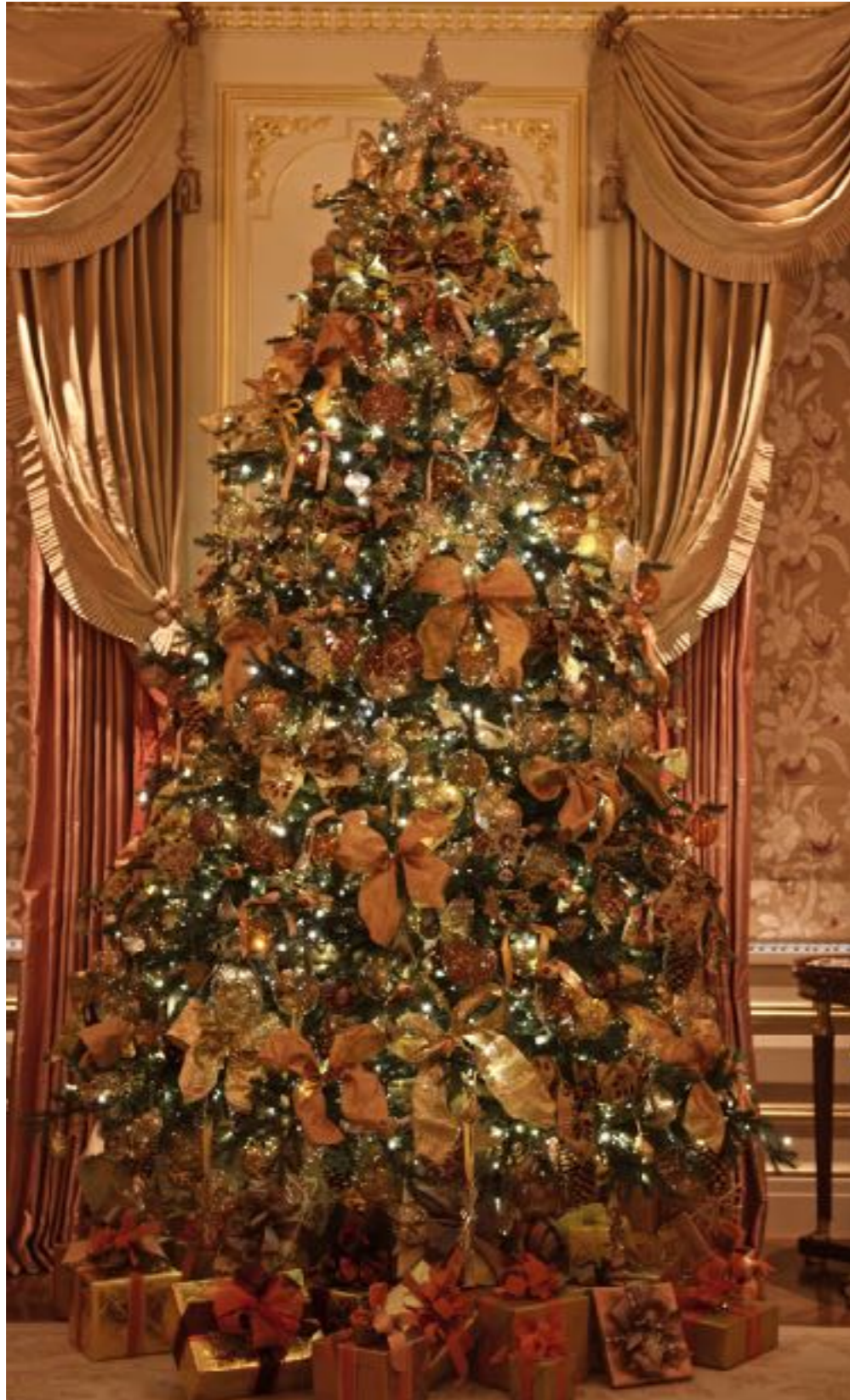
Pulbrook & Gould's bespoke Christmas decoration service; interiors and trees.