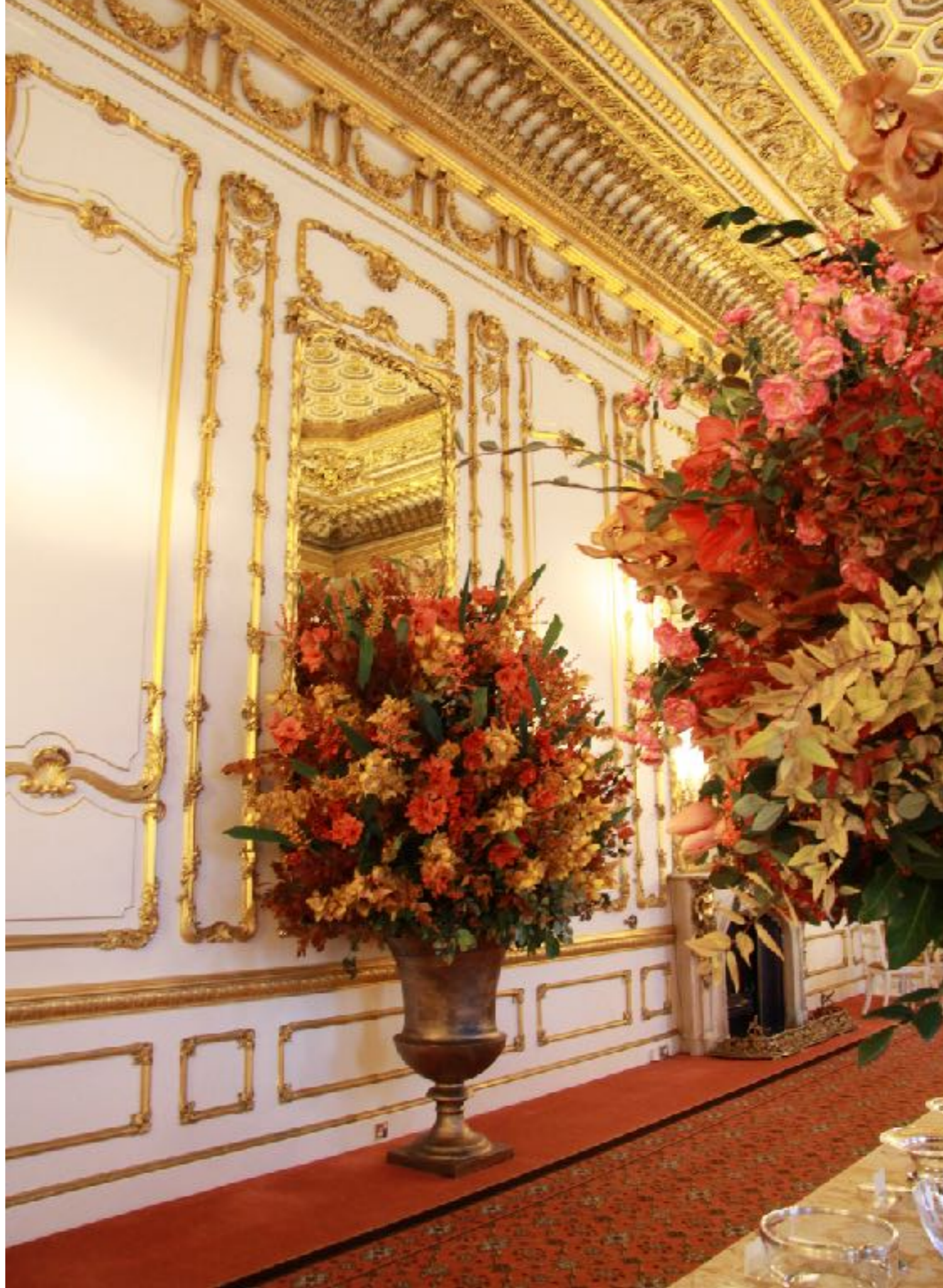
Setting a glamorous scene for a party at Apsley House.