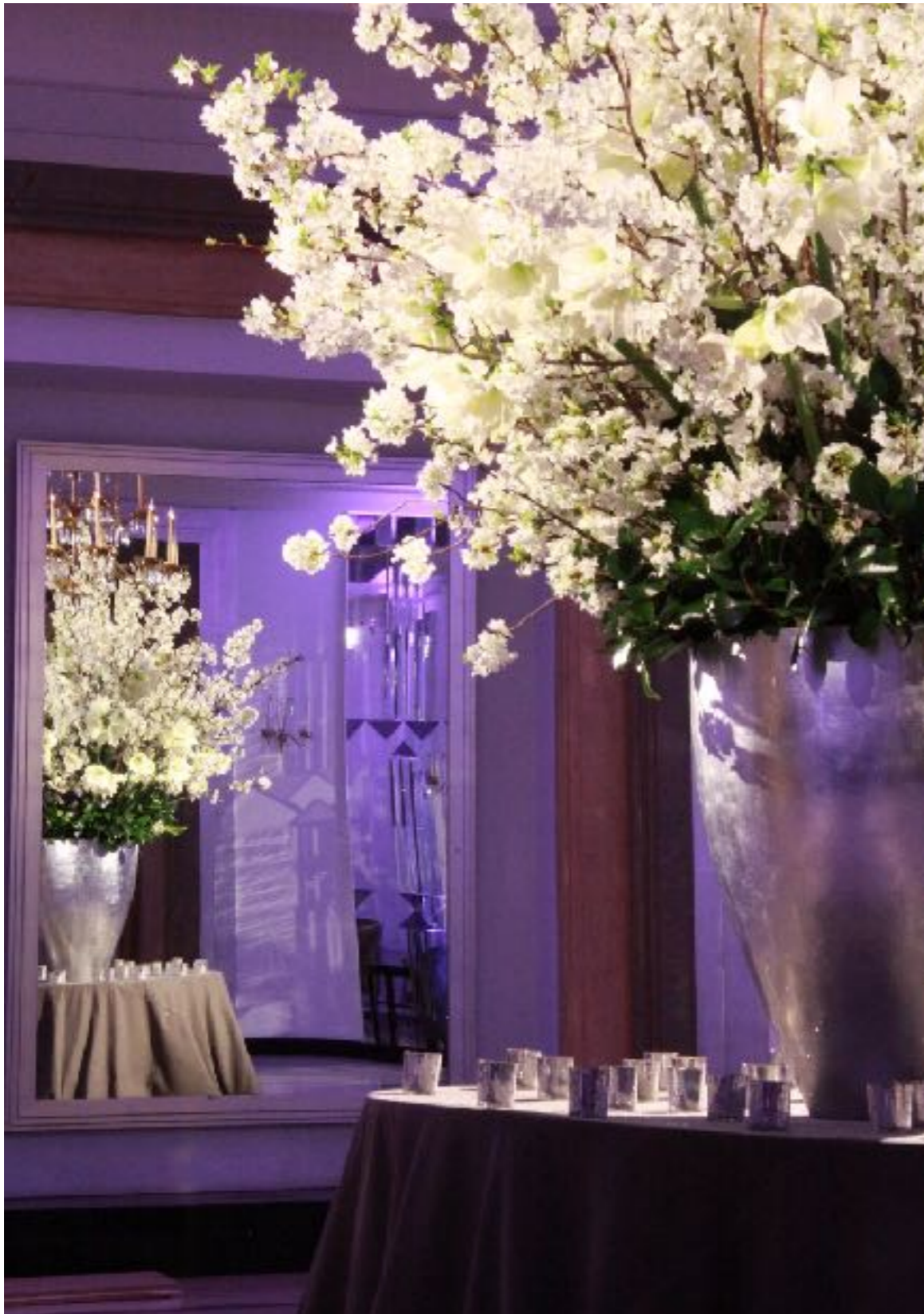
Magnificent flowers, setting the scene for a ball at Claridge's.