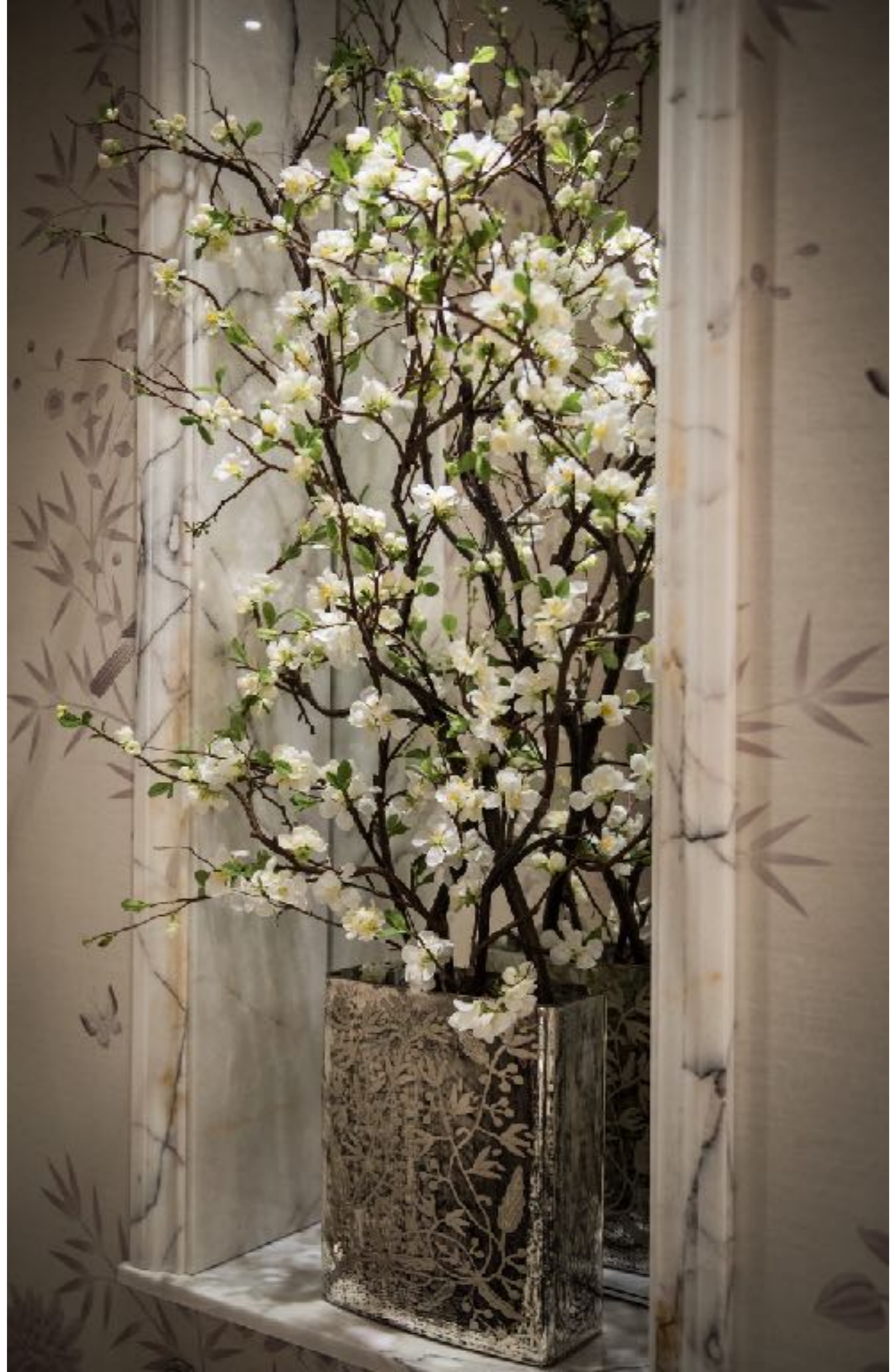
Combining fresh and faux flowers to make a lasting interior statement.