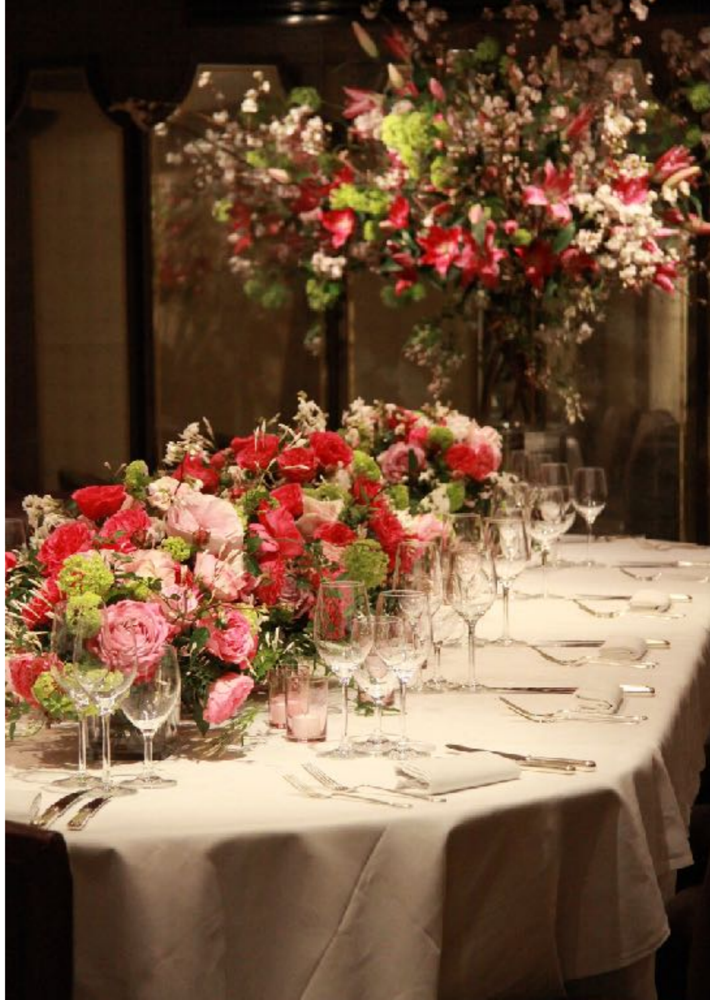
A table laid for a magnificent dinner party