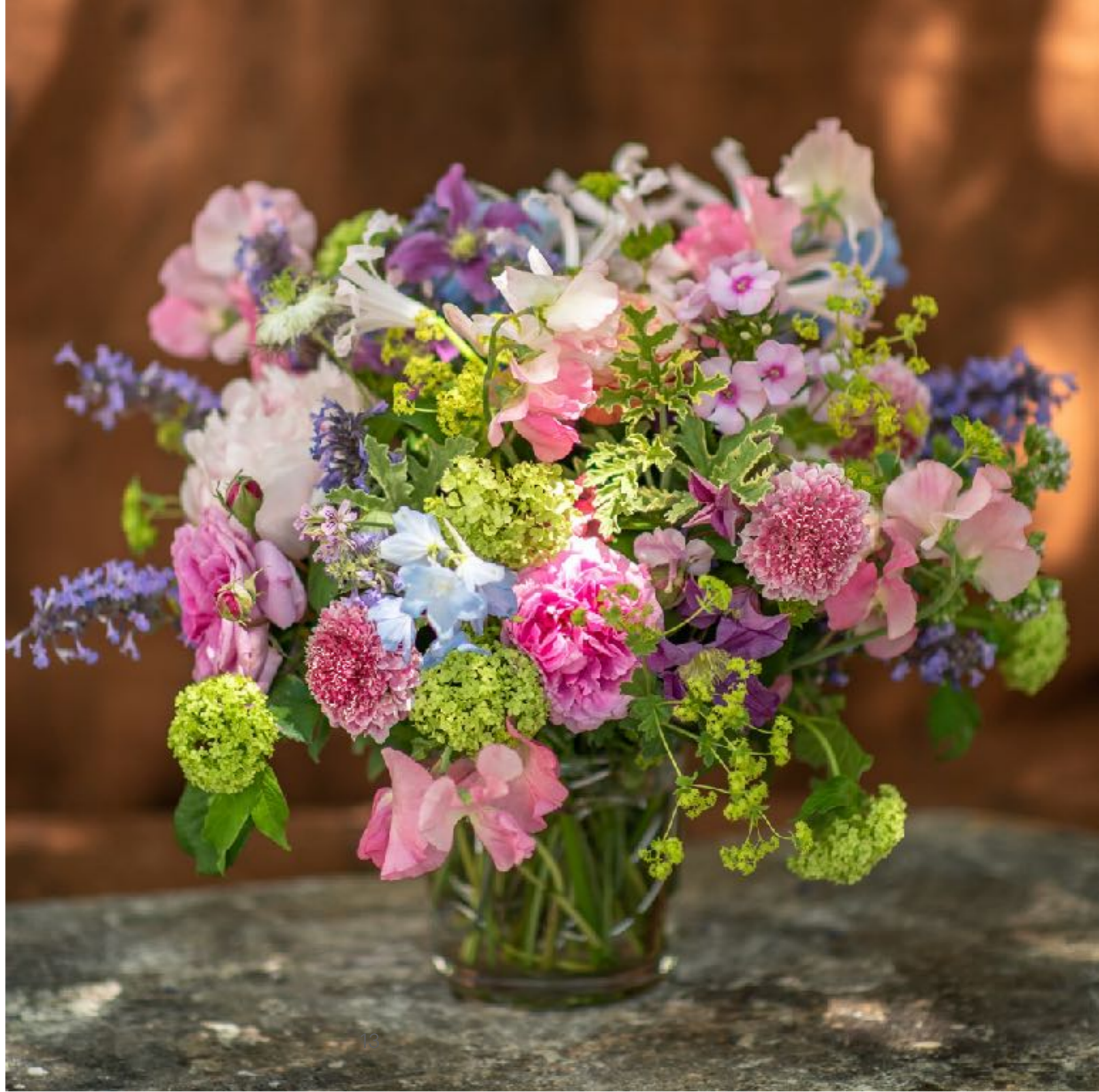
A classic celebration of the English country garden.