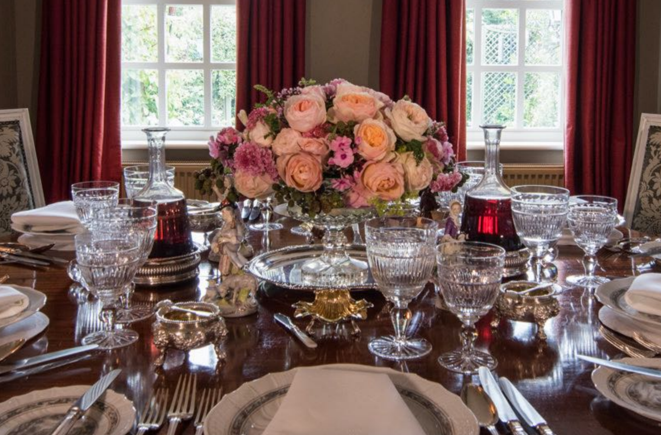
Flowers for friends. A centrepiece for a small luncheon party.