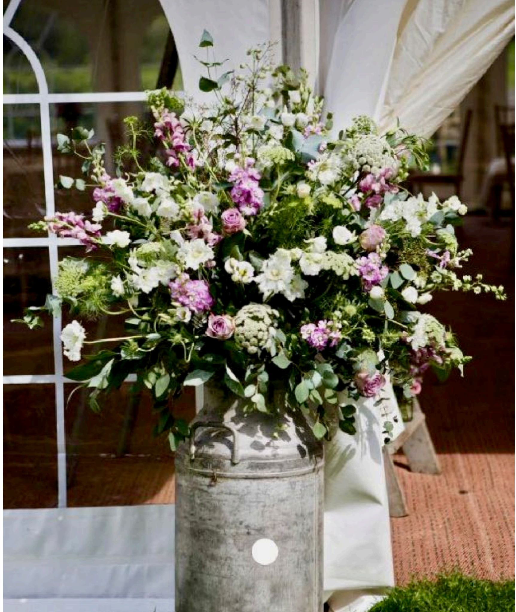
High creativity for an English country wedding.