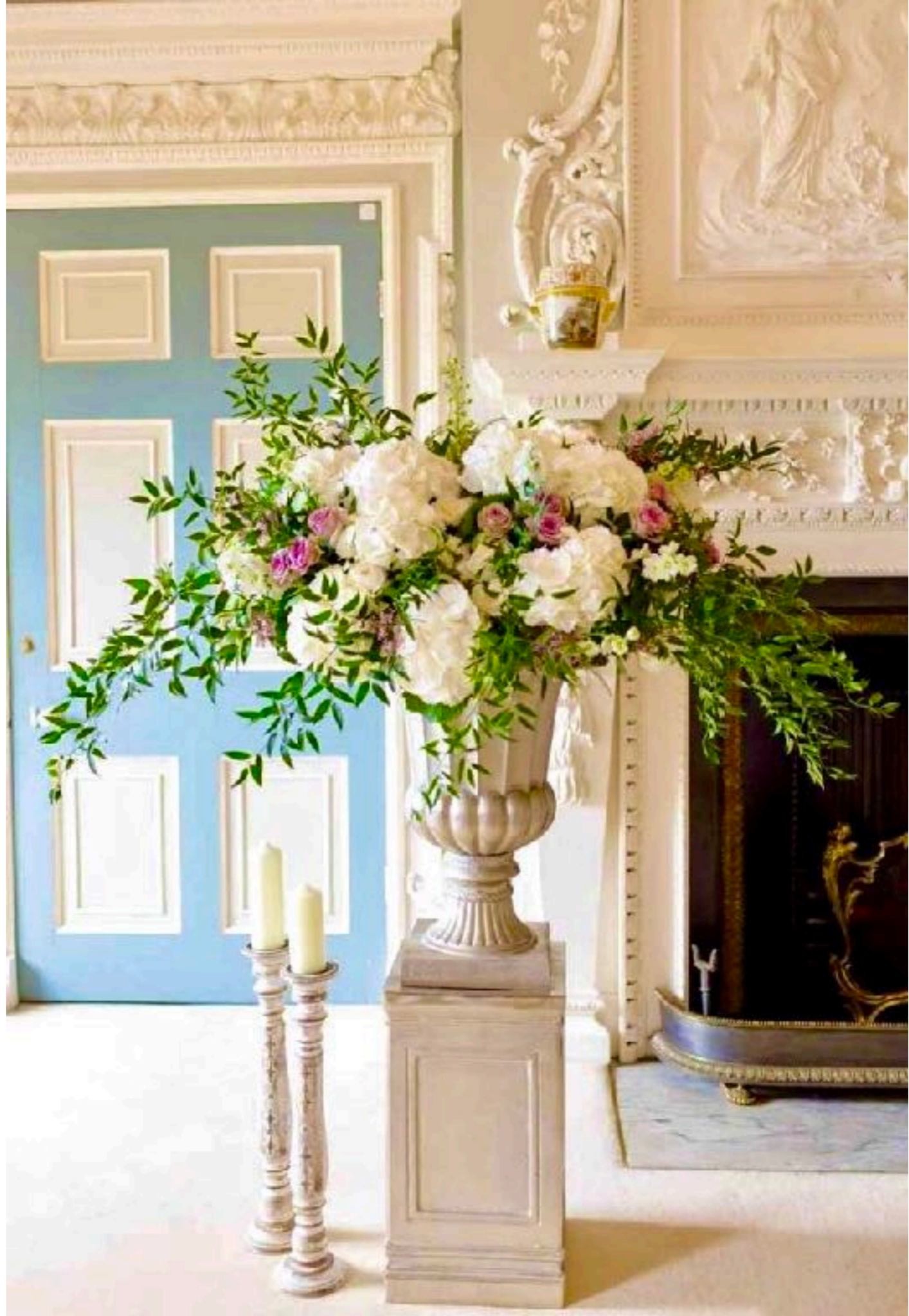
A classic Pulbrook & Gould arrangement, bringing the joy and beauty of the English country garden to the finest homes in the country.