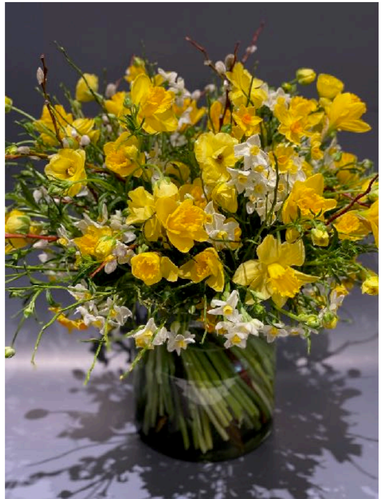
Seasonal arrangements based on the English country garden