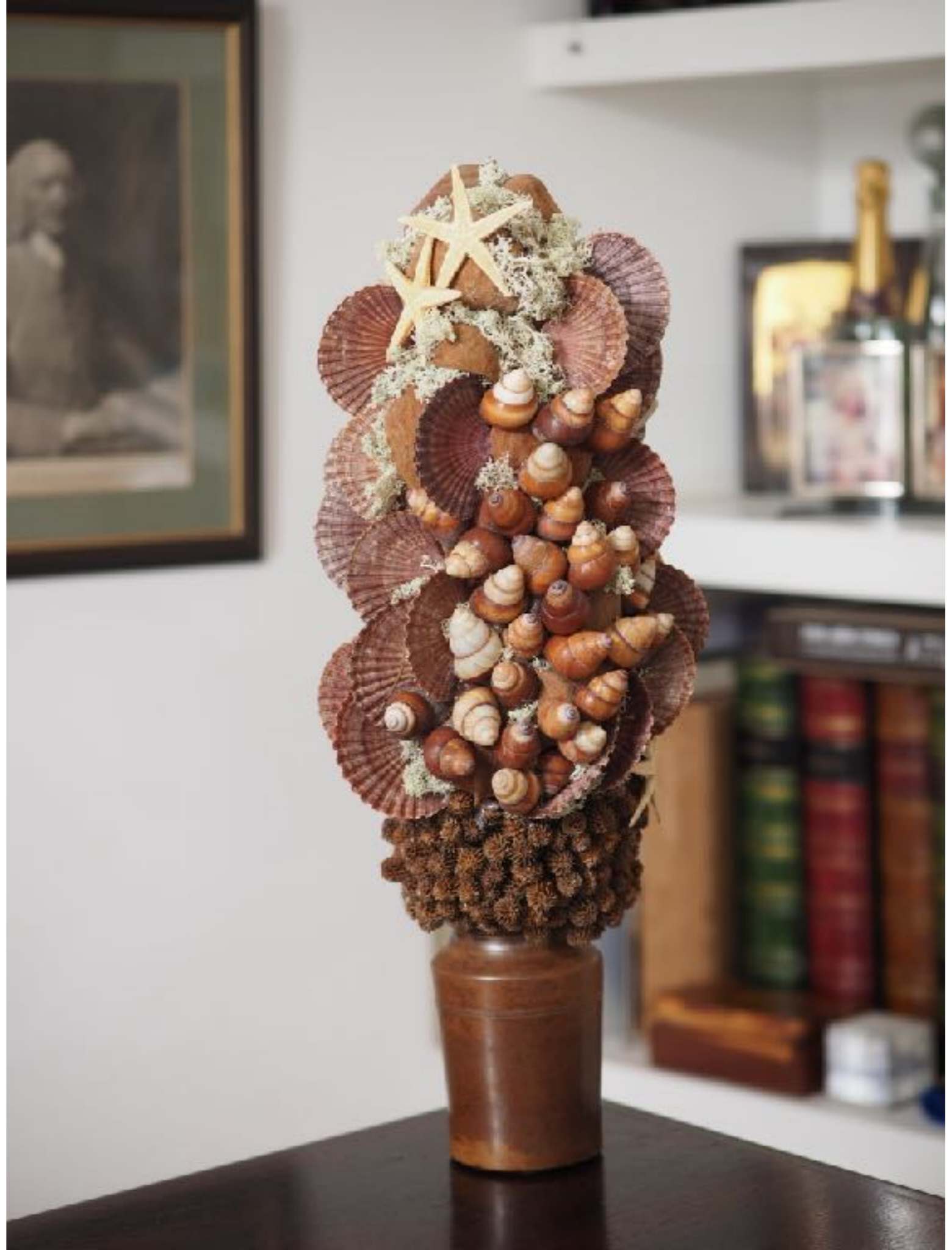
Marine plants, shells, starfish: a beautiful botanical sculpture in situ.