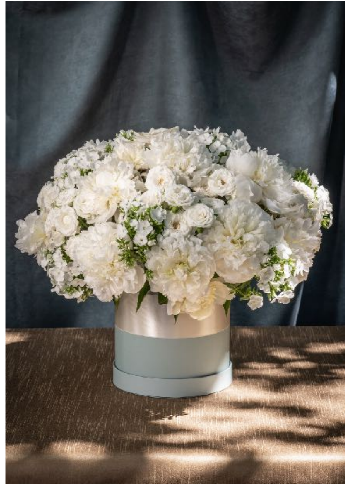
The perfect gift: Pulbrook & Gould bouquets and hatboxes.