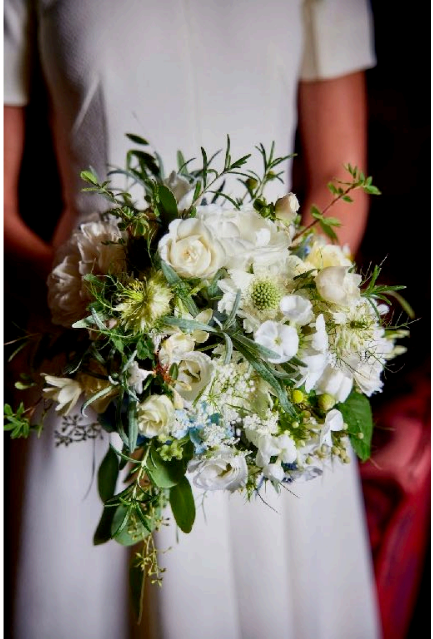
The bouquet: one of the highlights of the wedding day.