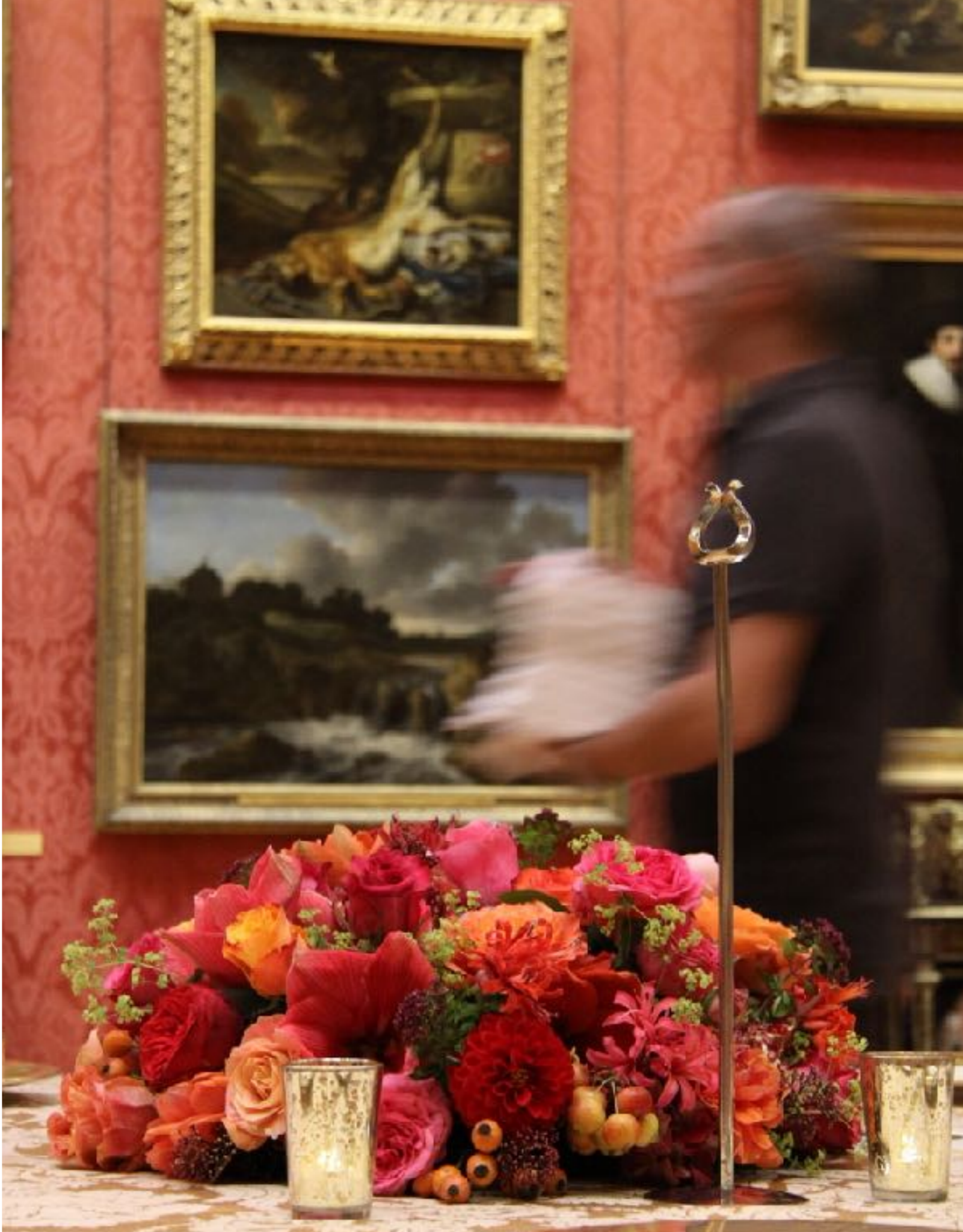
Table decorations for a dinner at the Wallace Collection.