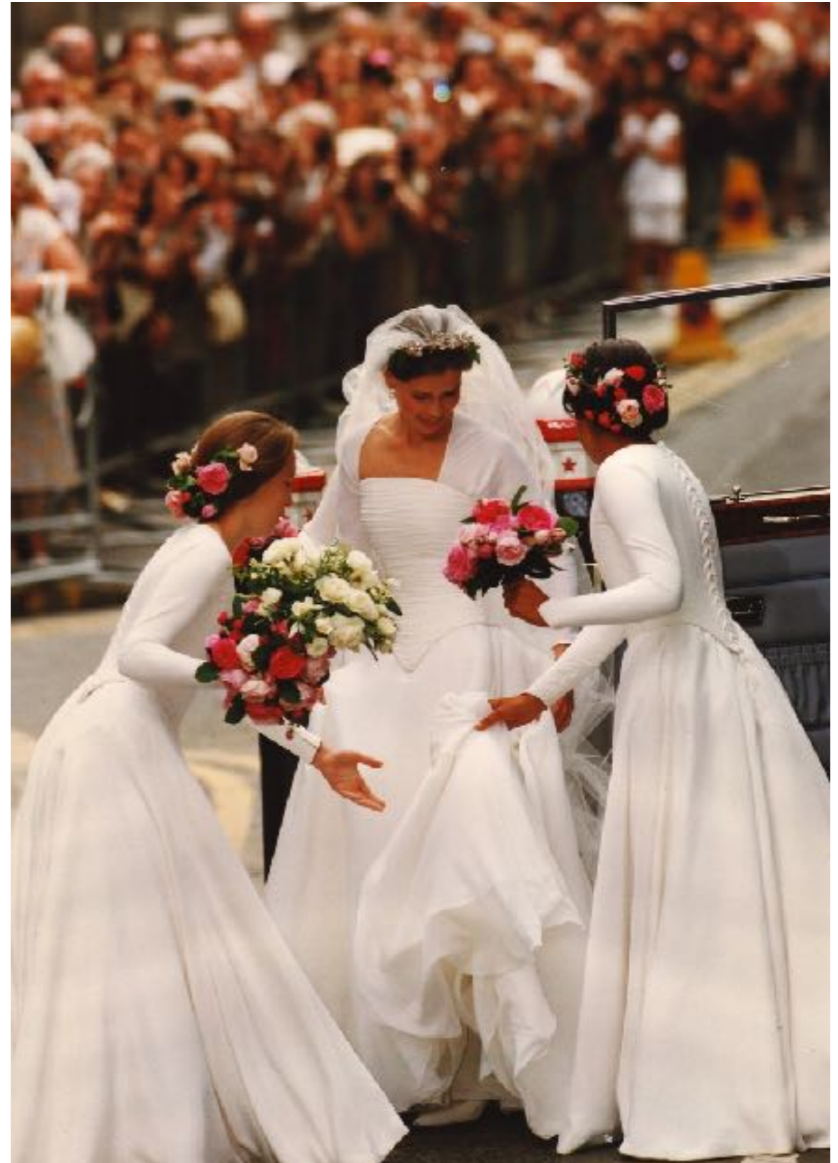
The wedding of Lady Sarah Armstrong-Jones and Daniel Chatto, St Stephen's Walbrook, London, 1994