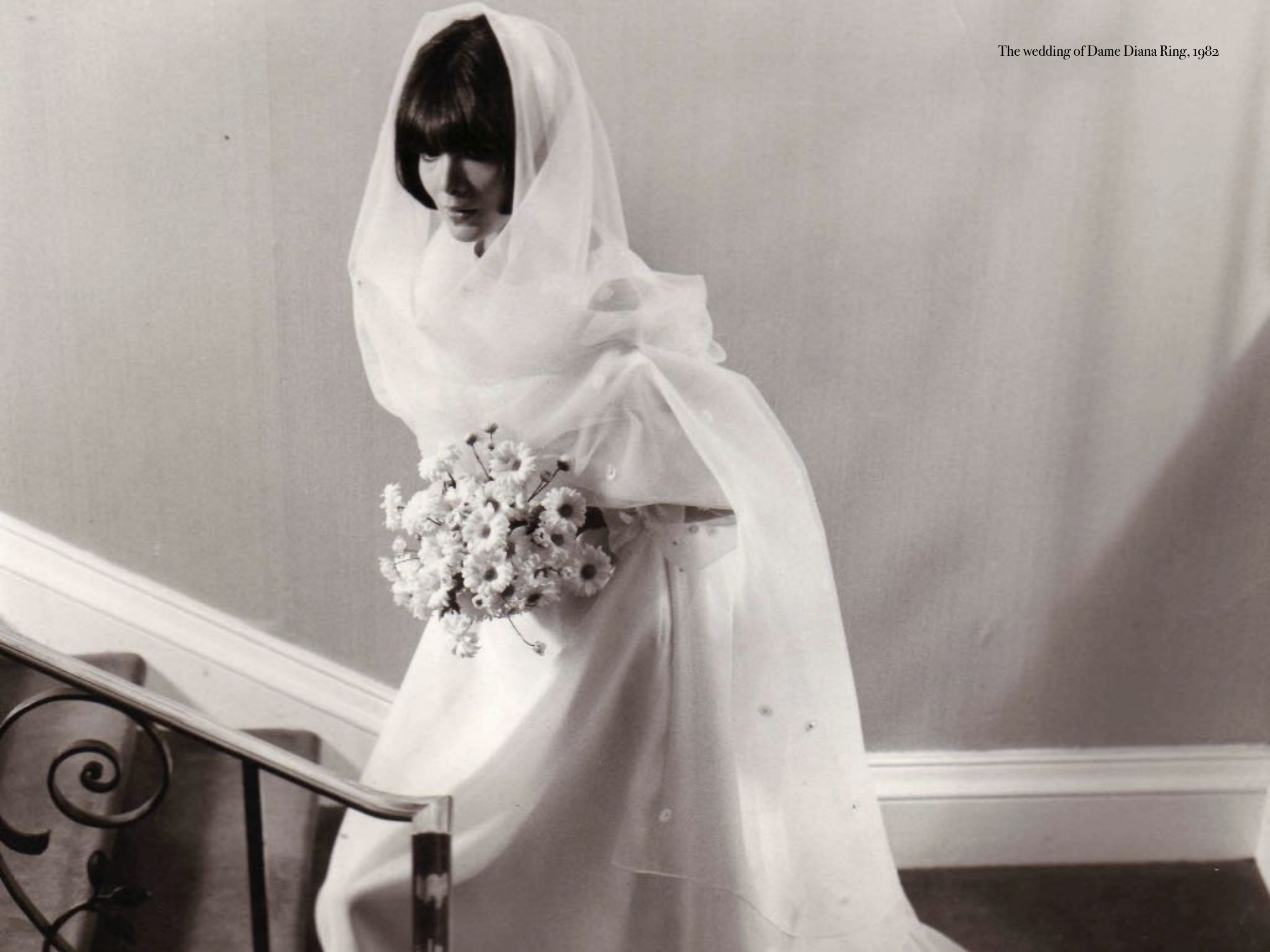
The wedding of Dame Diana Ring, 1982