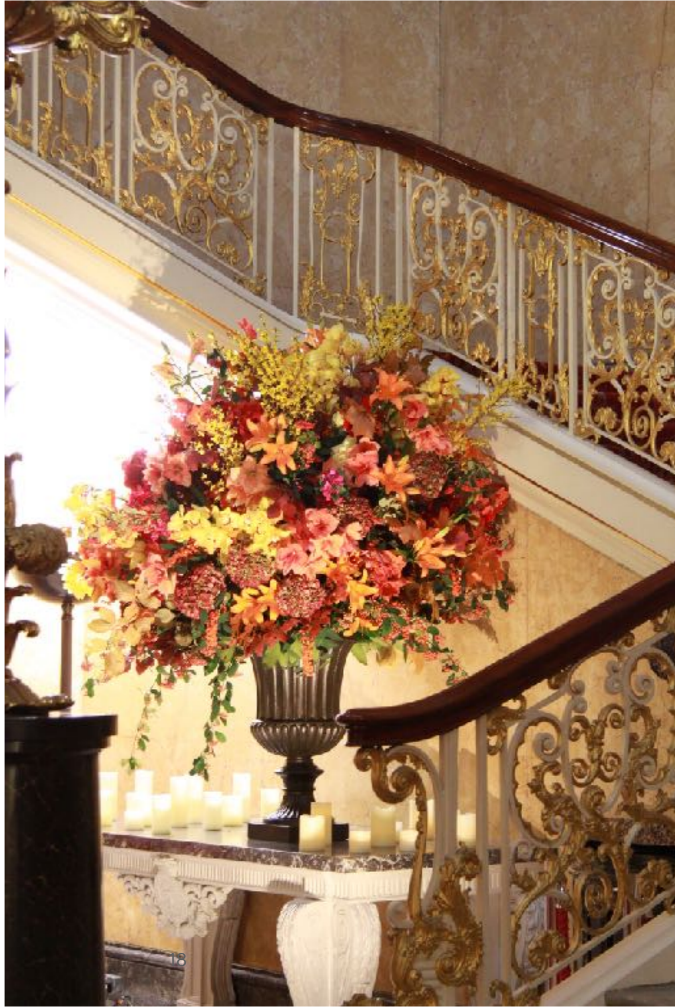
A magnificent statement on a hall table.