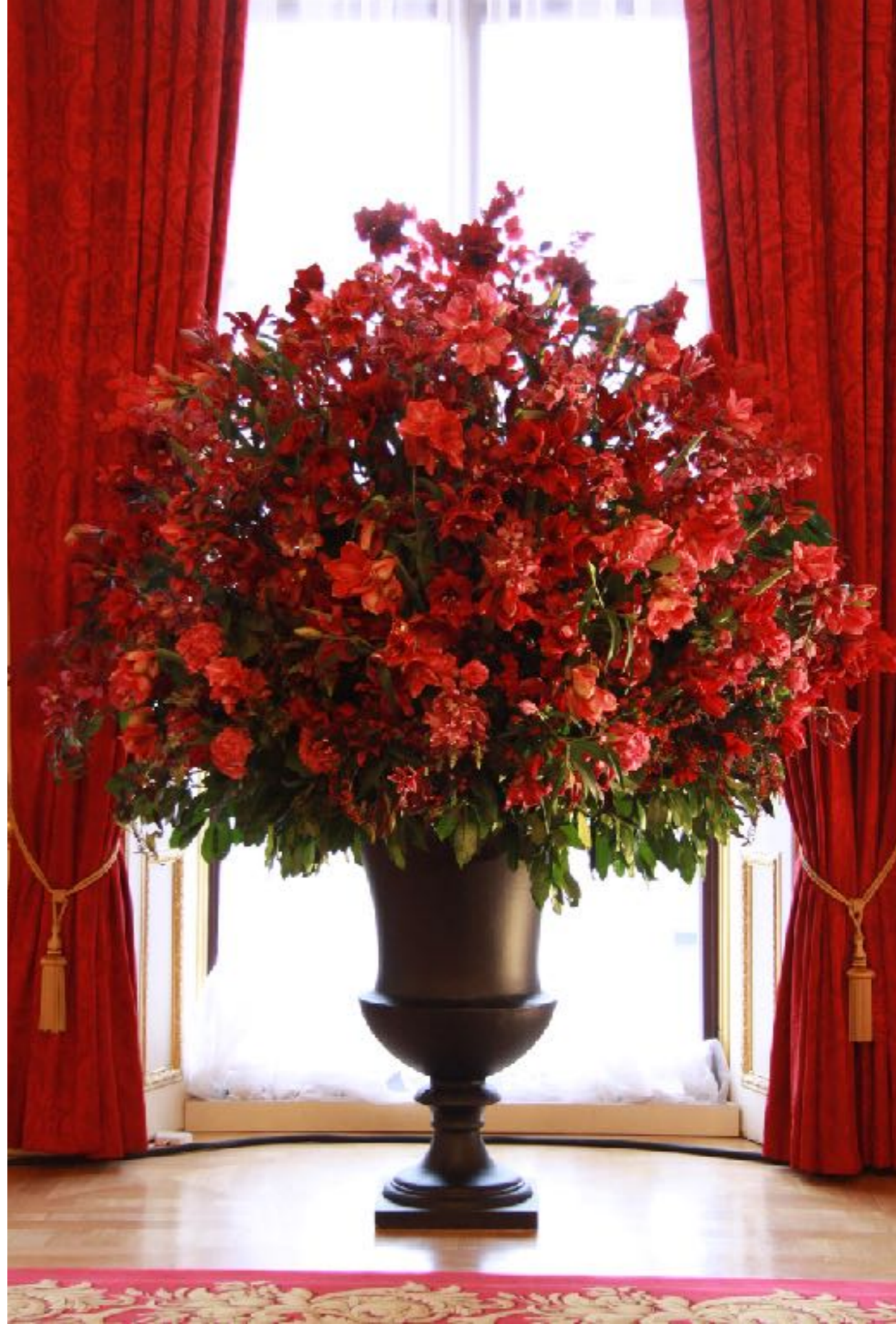
A statement urn arrangement in a ballroom.