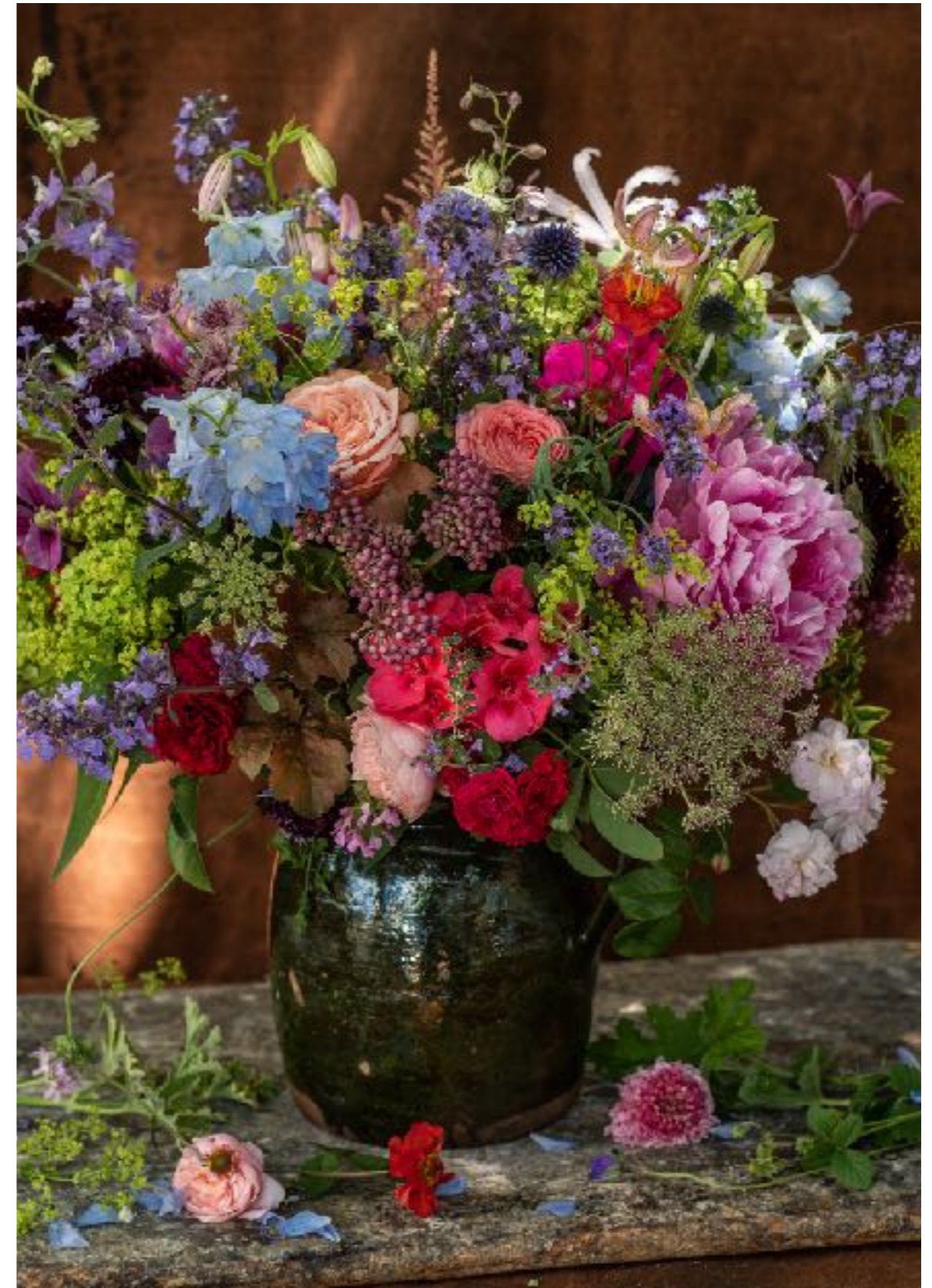
Seasonal arrangements based on the English country garden