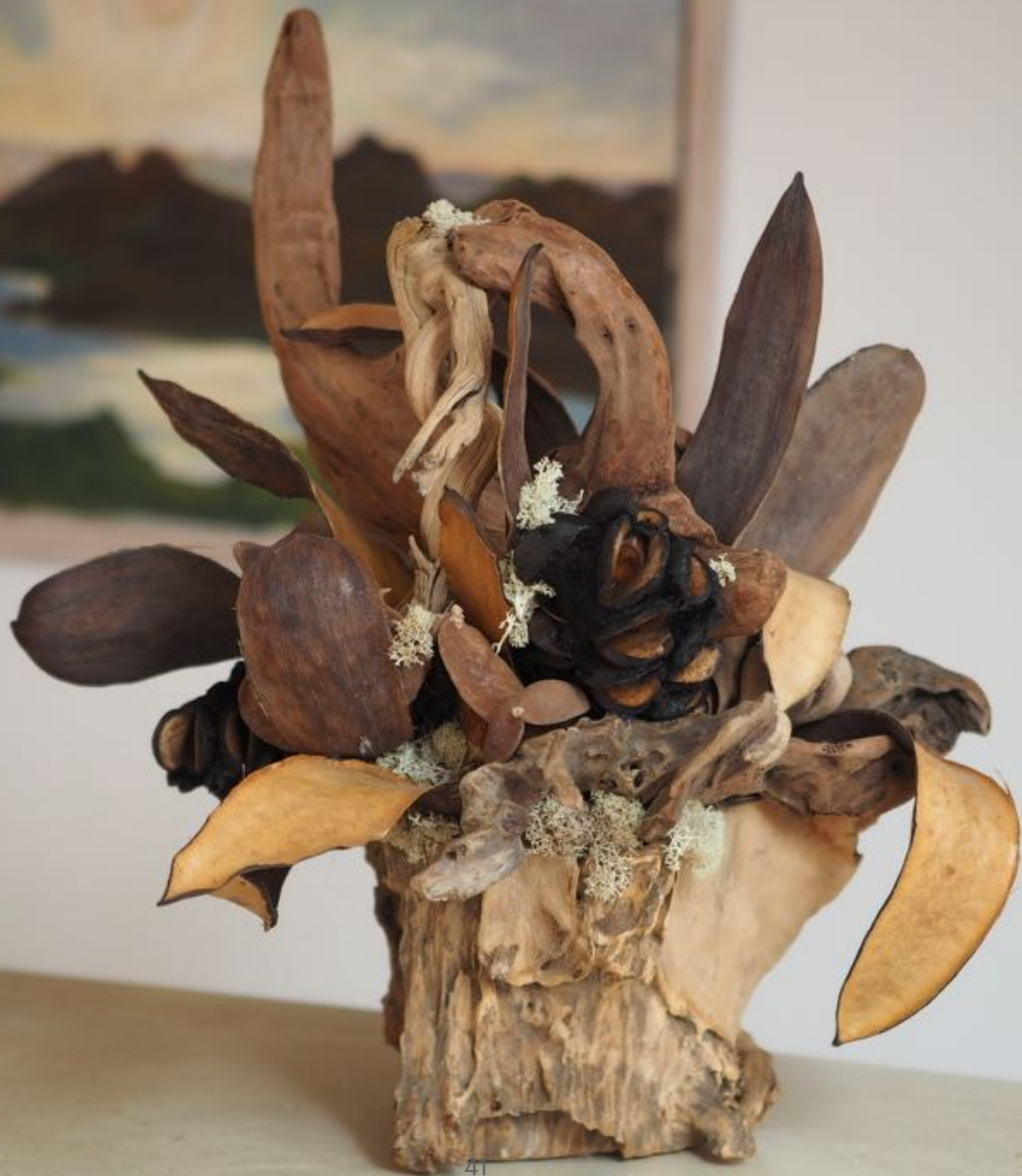
A signature botanical sculpture makes a perfect everlasting art work in any interior