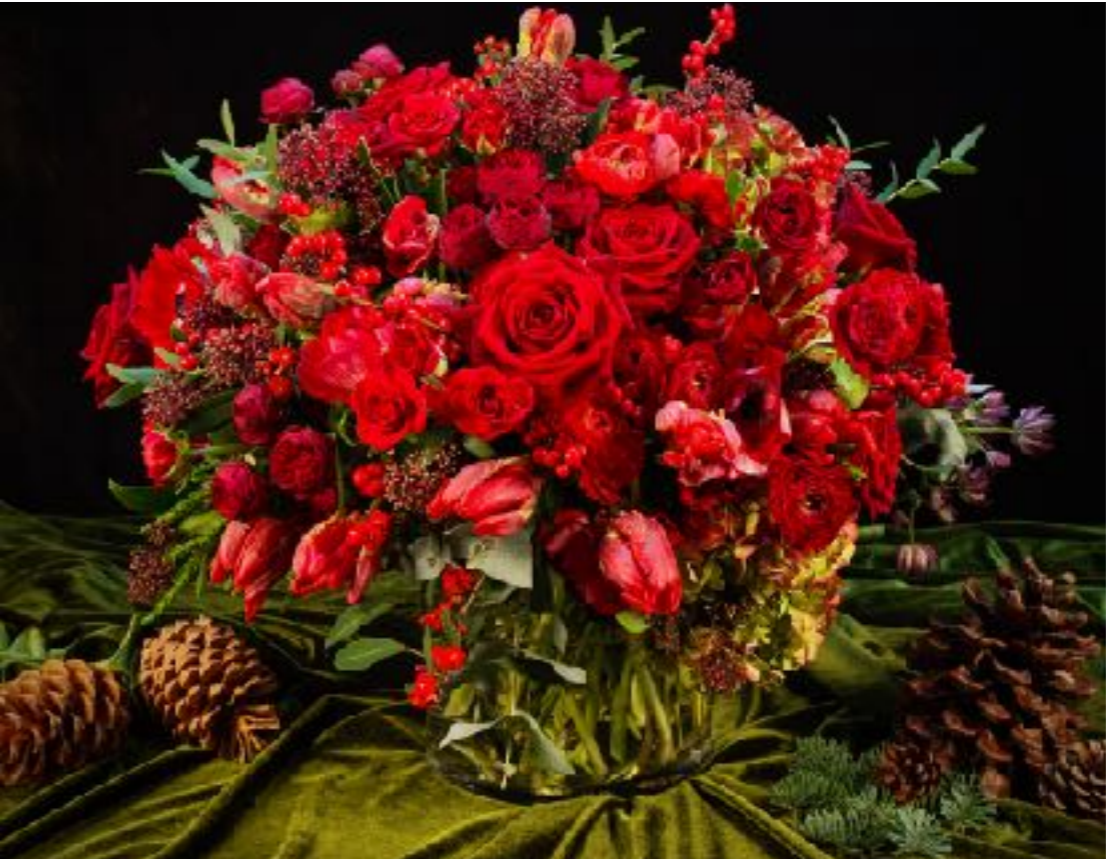
Christmas by Pulbrook & Gould - bespoke wreaths, beautiful centrepieces, seasonal arrangements and tree decorating services.