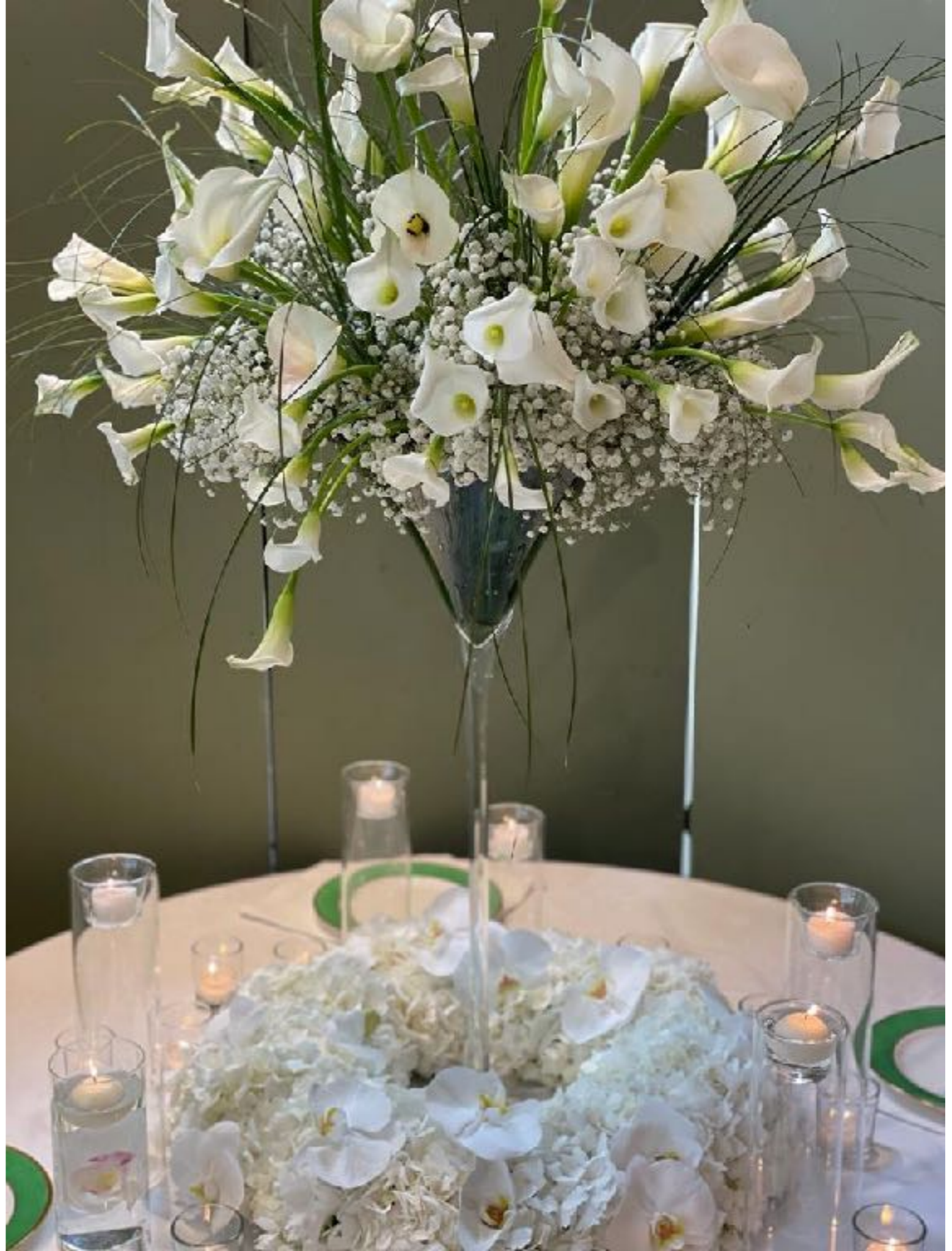
A spectacular urban wedding creations at the Goring Hotel.