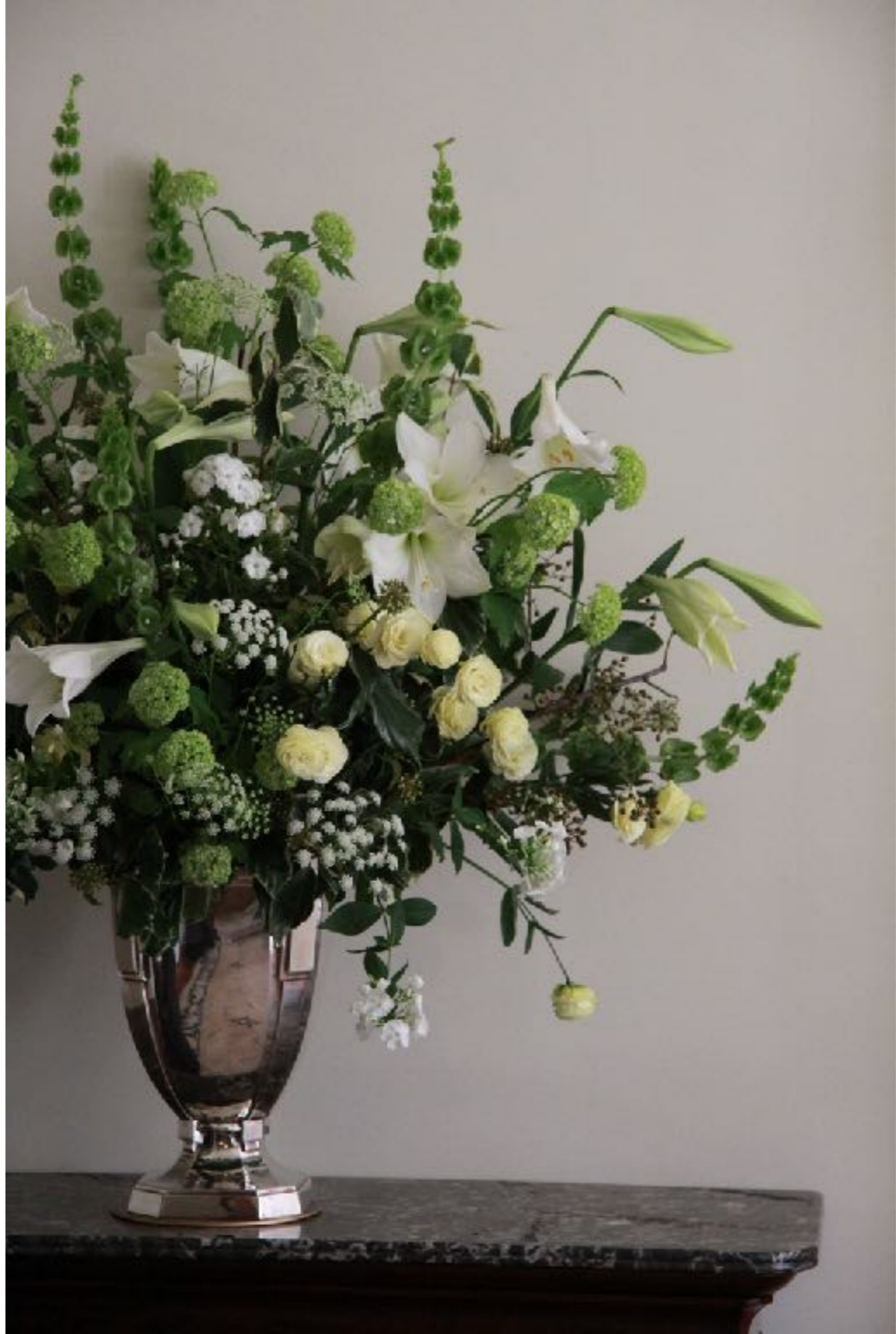
A magnificent statement on a hall table.