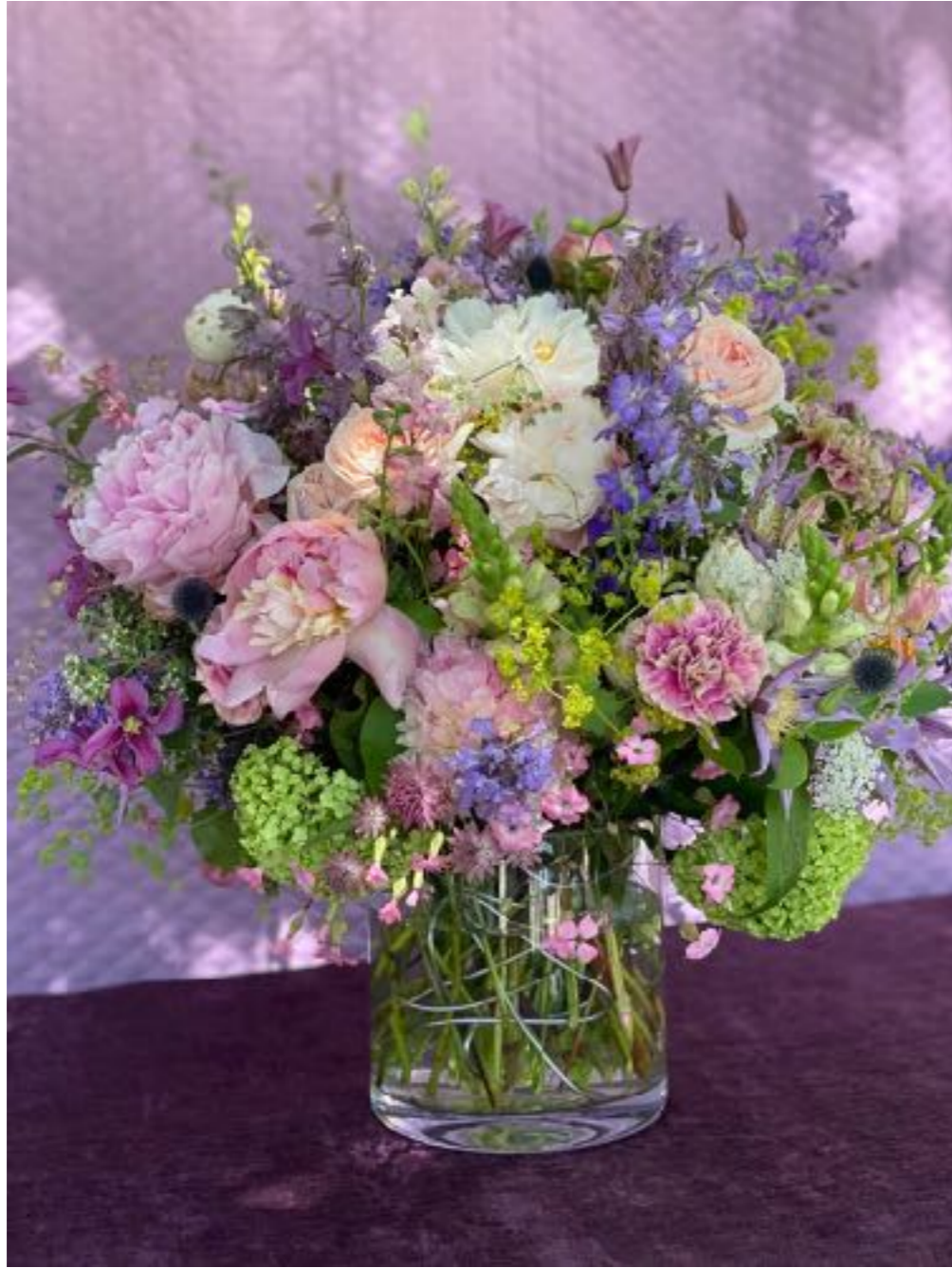
Versatile, seasonal, stylish and always eye-catching.