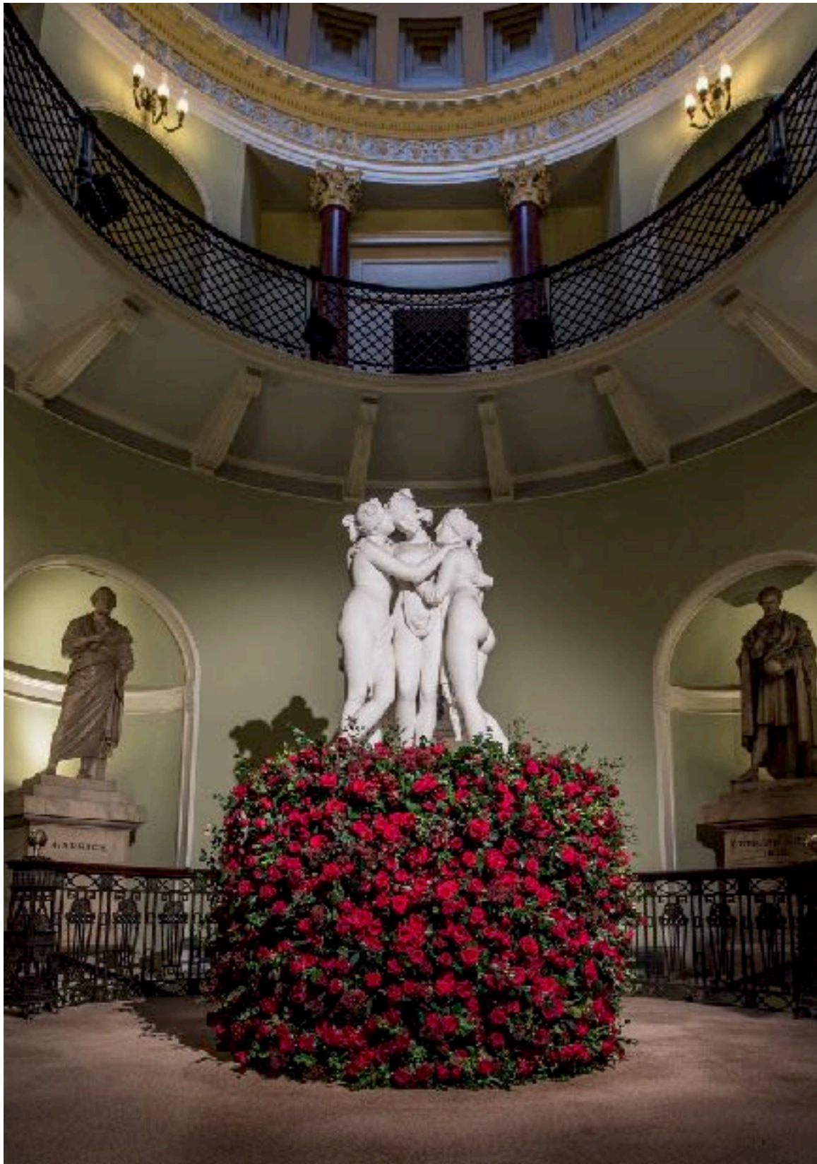
A mixed group, predominately red roses, for a private party.