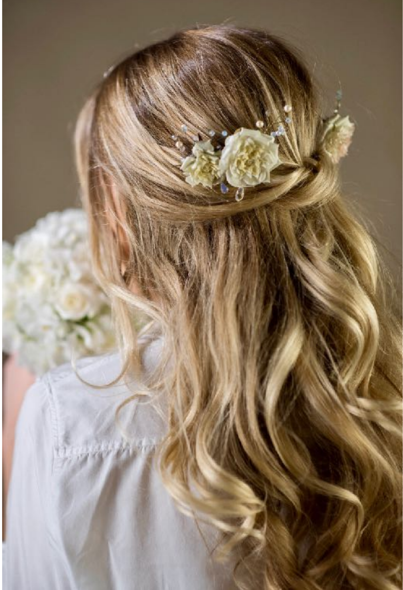
More bridal flowers; bouquets, hairpieces and corsages are all crucial details on a wedding day.