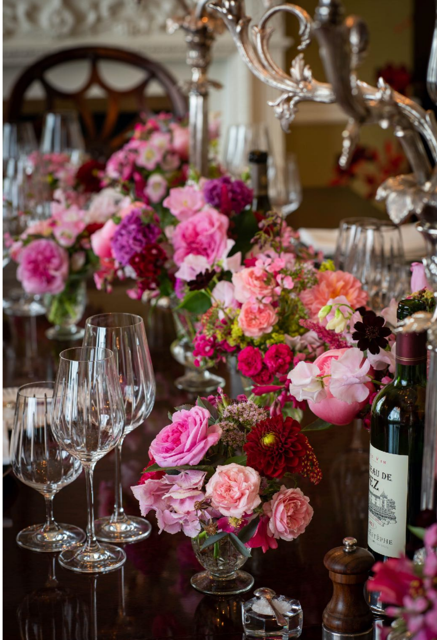
Spring flowers for an intimate dinner at home.