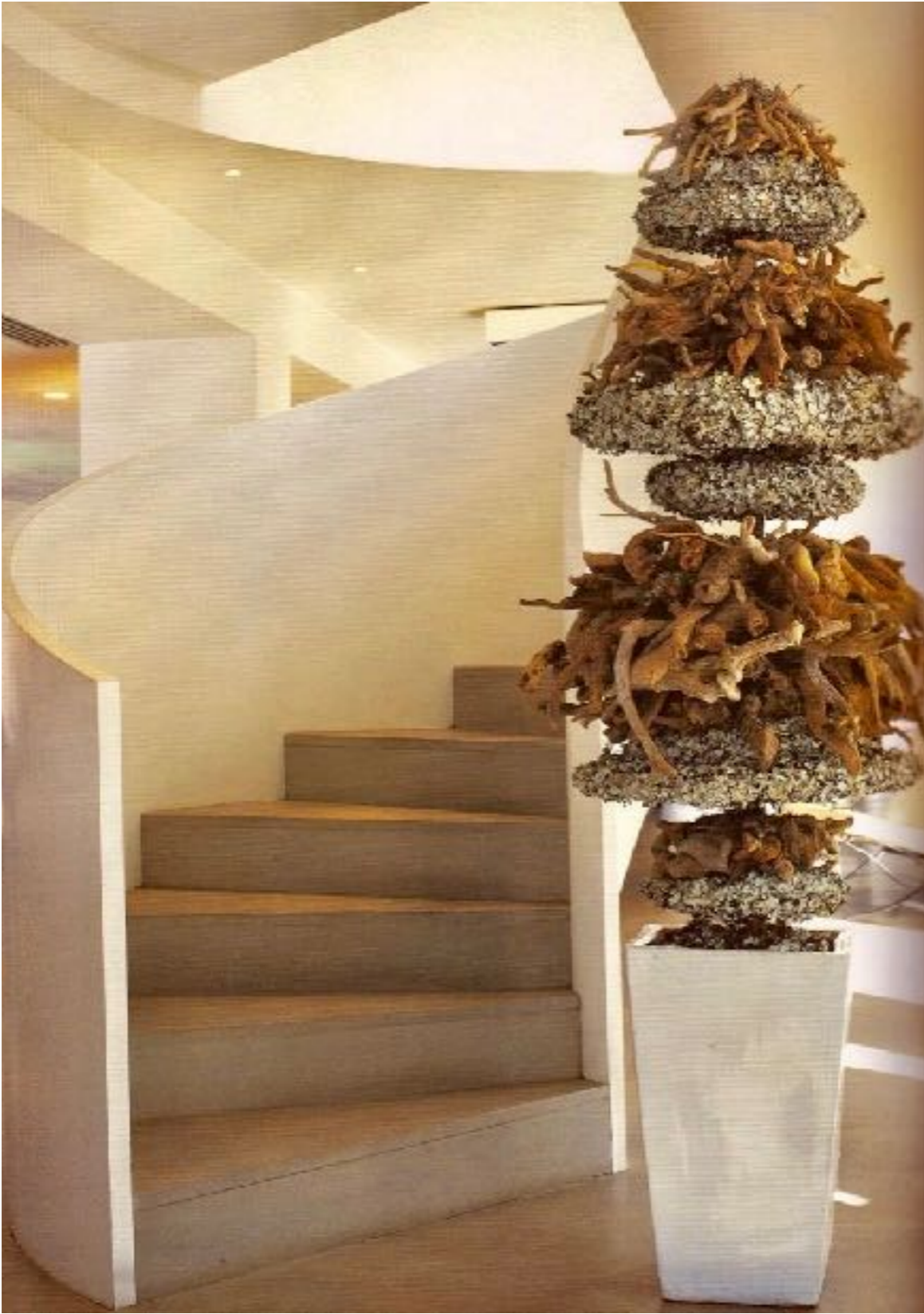
Fantastic interior creations.