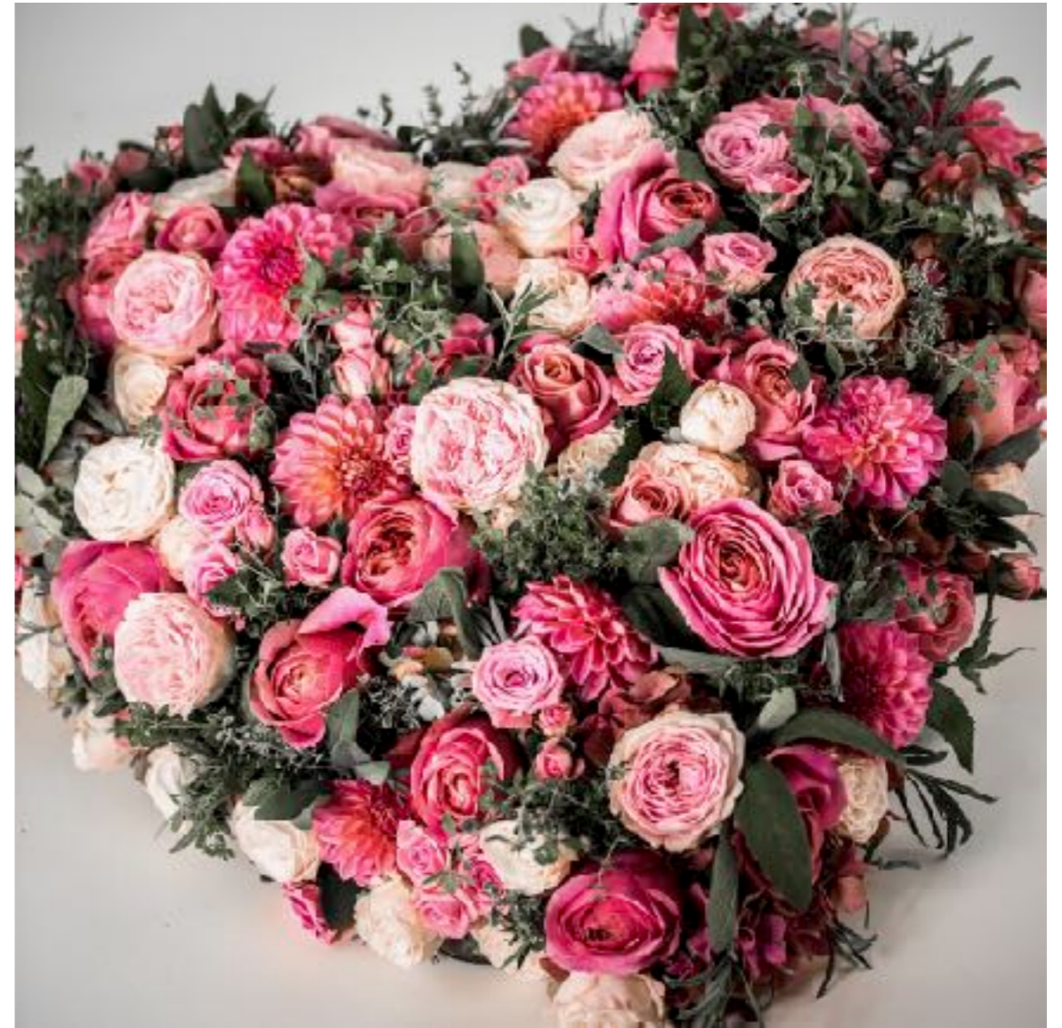
Valentine's Day by Pulbrook & Gould.