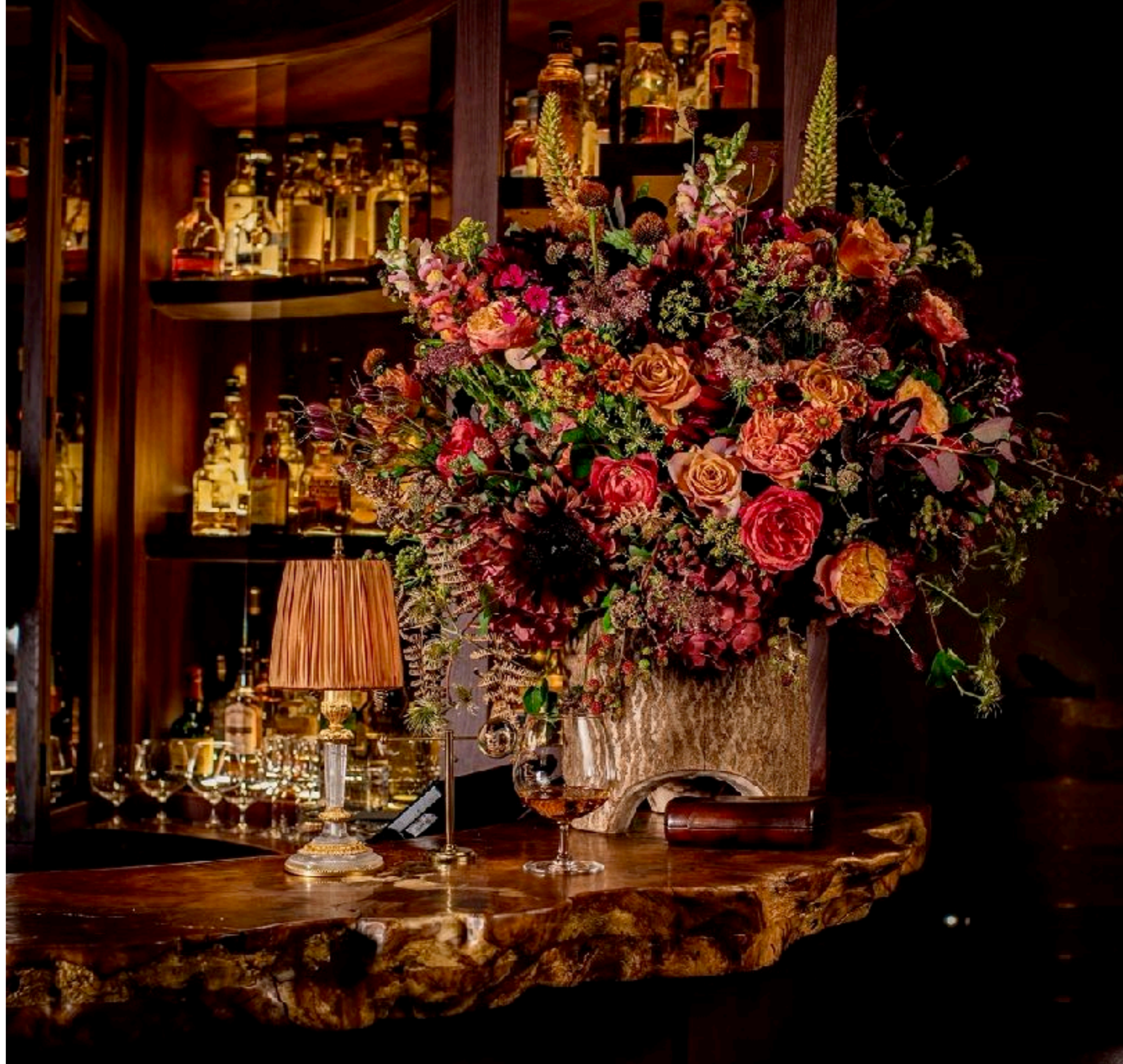
A permanent arrangement for the bar at the Connaught Hotel.