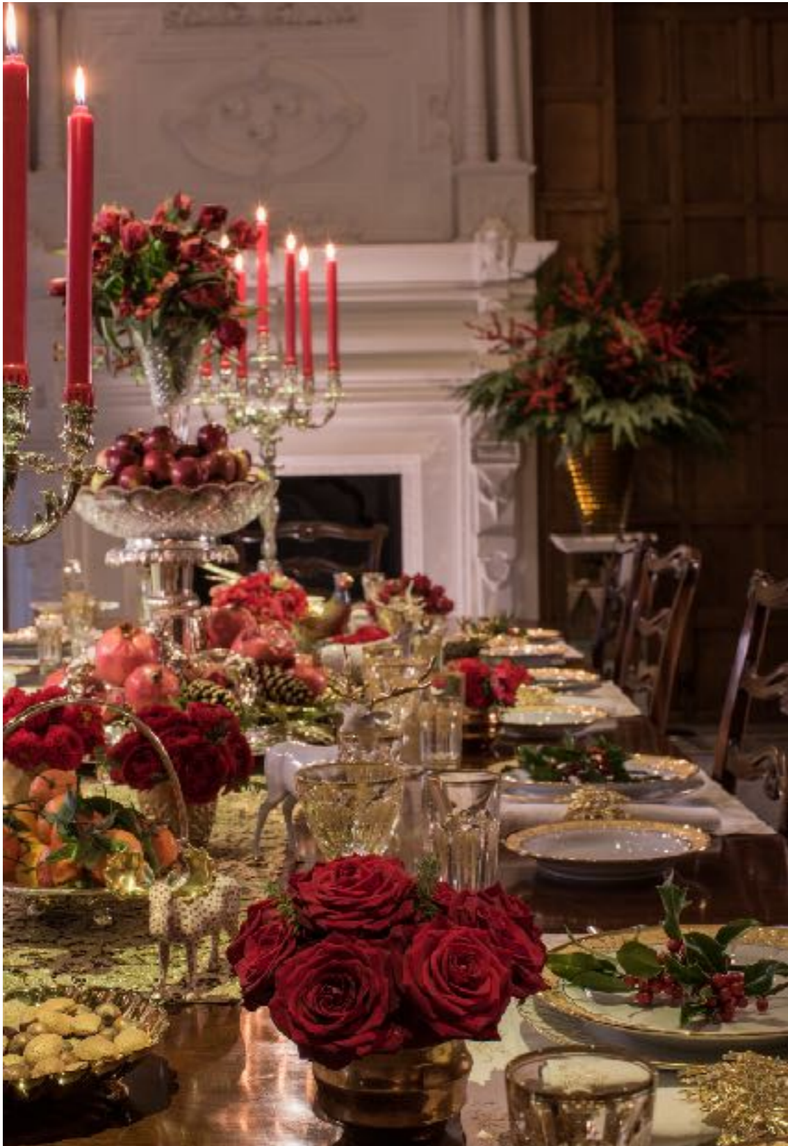
Two tables laid for a wonderful celebration.