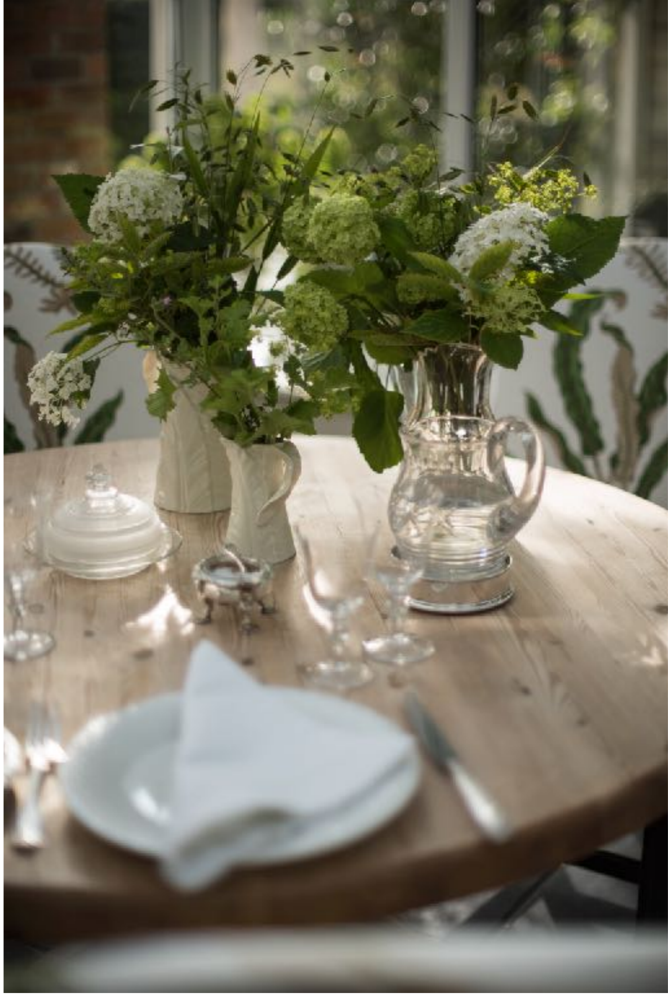
Simple flowers for a kitchen supper.