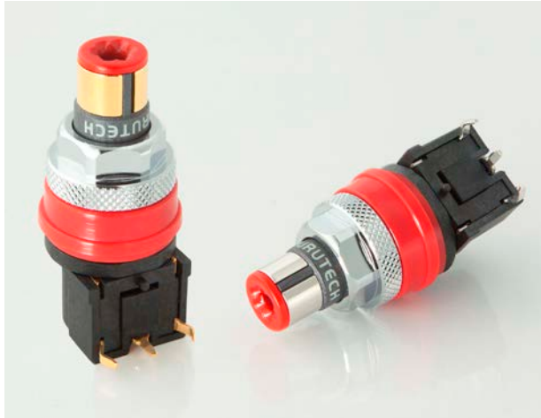
Furutech FT-909 RCA socket for PCB

Make A More Powerful Connection With Furutech Pure Transmission Technology