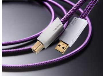
GT2Pro -B (USB A-B Type)

Make A More Powerful Connection With Furutech Pure Transmission Technology