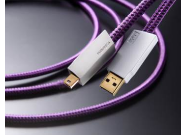
GT2Pro -mB (USB A-mB Type)