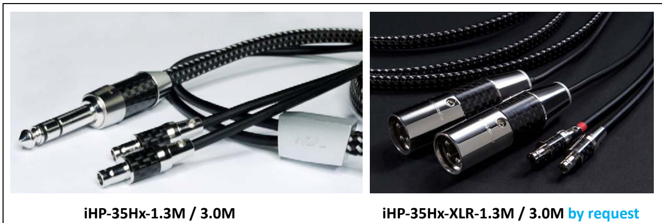
iHP-35Hx-1.3M / 3.0M

High-quality headphones are a must in the age of personal, portable electronics, but many are supplied with inferior throw-away cables. Headphone listening is an intimate experience and enthusiasts always want better sound. ADL's iHP-35 cables accomplish that in spectacular fashion with headphones, players and headphone amplifiers. The iHP-35 series is available in five versions to make the perfect connection!