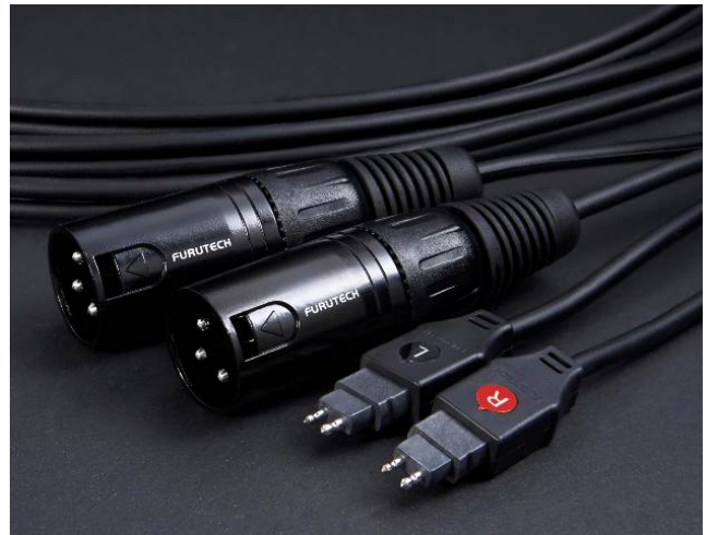
iHP-35S-XLR-1.3M / 3.0M by request