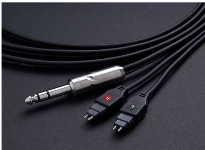
iHP-35S-1.3M / 3.0M

High-quality headphones are a must in the age of personal, portable electronics, but many are supplied with inferior throw-away cables. Headphone listening is an intimate experience and enthusiasts always want better sound. ADL's iHP-35 cables accomplish that in spectacular fashion with headphones, players and headphone amplifiers. The iHP-35 series is available in five versions to make the perfect connection!